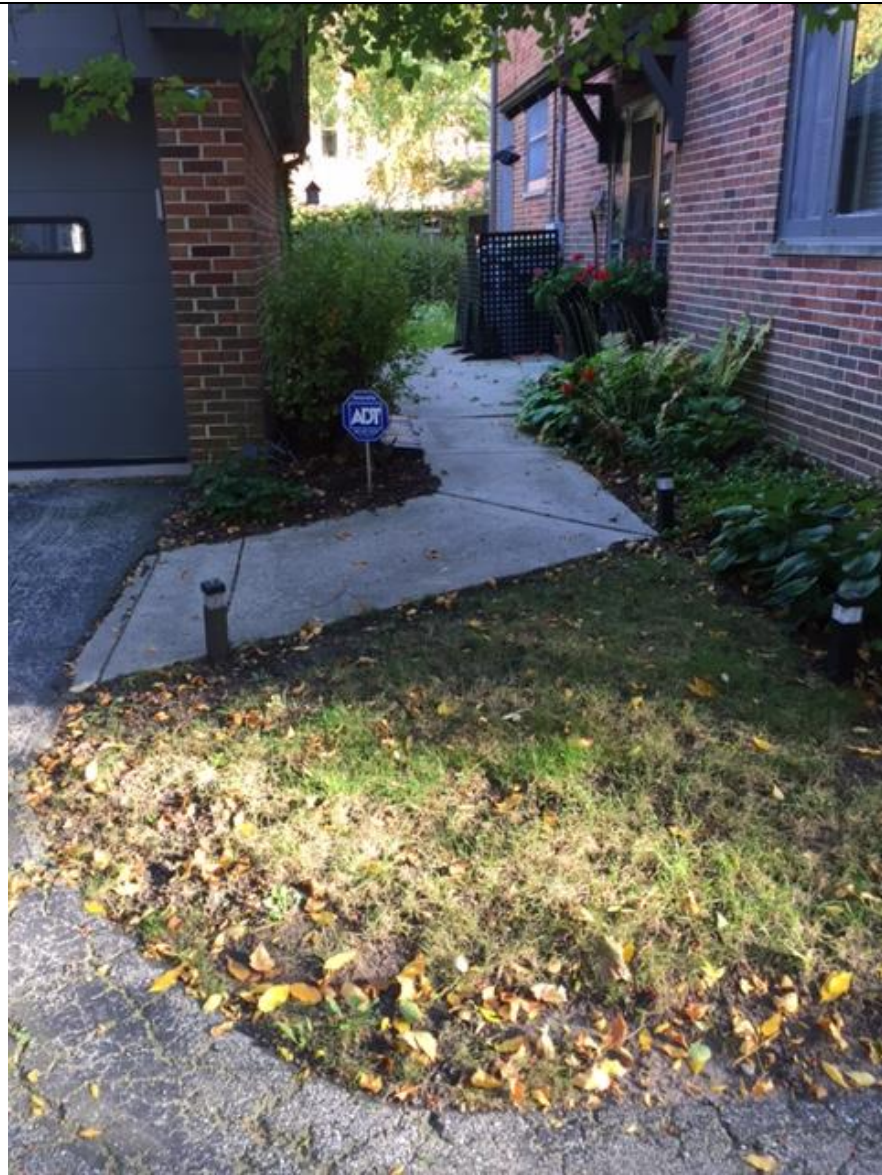
Footpath at north end of property