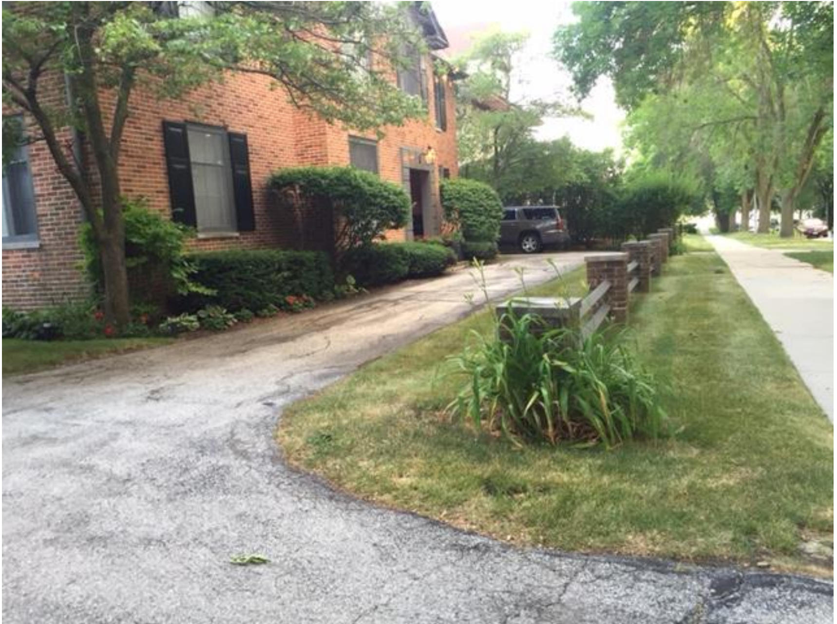
Present driveway and fence to be removed.