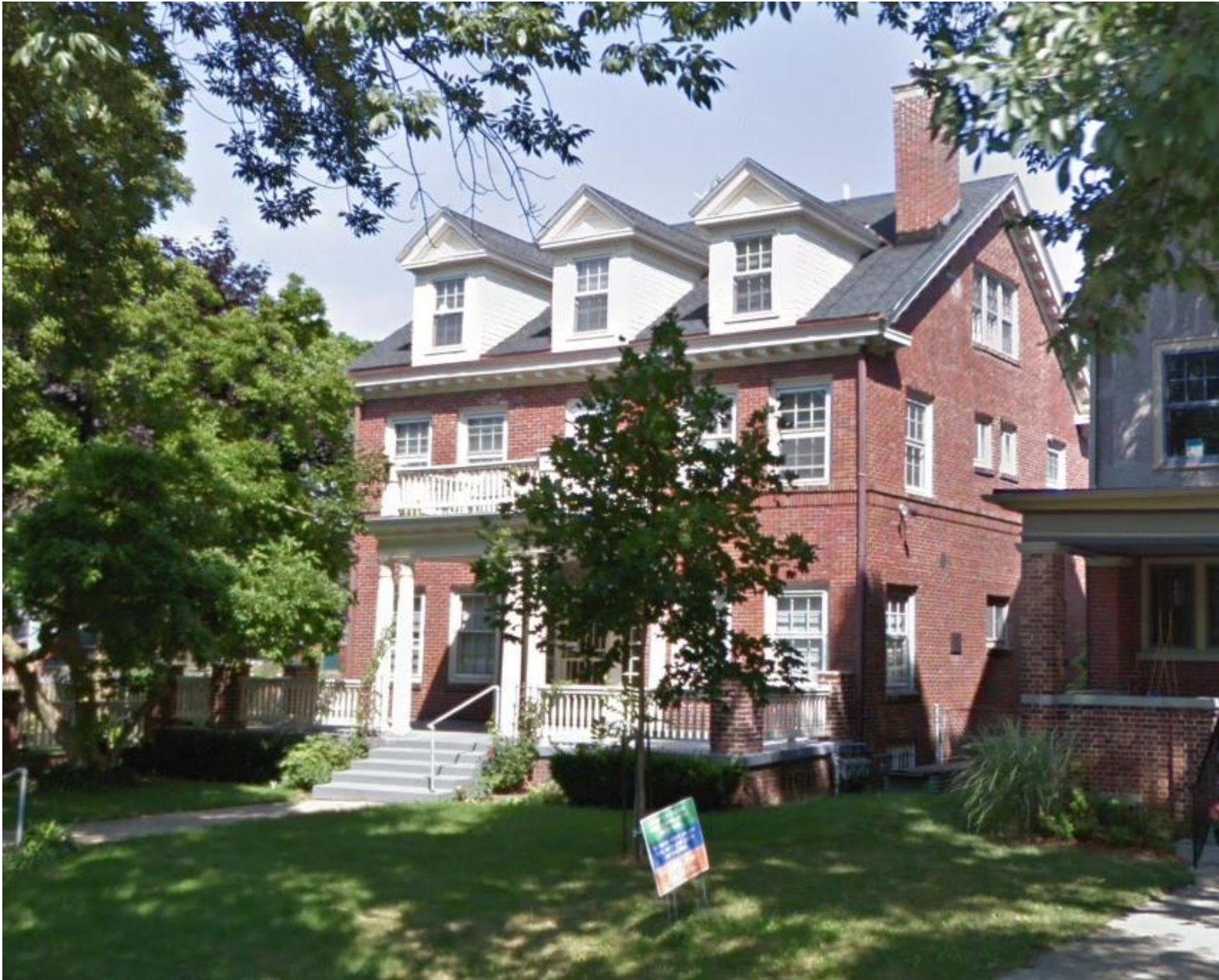
Current condition, 4 existing columns to be removed and replicated