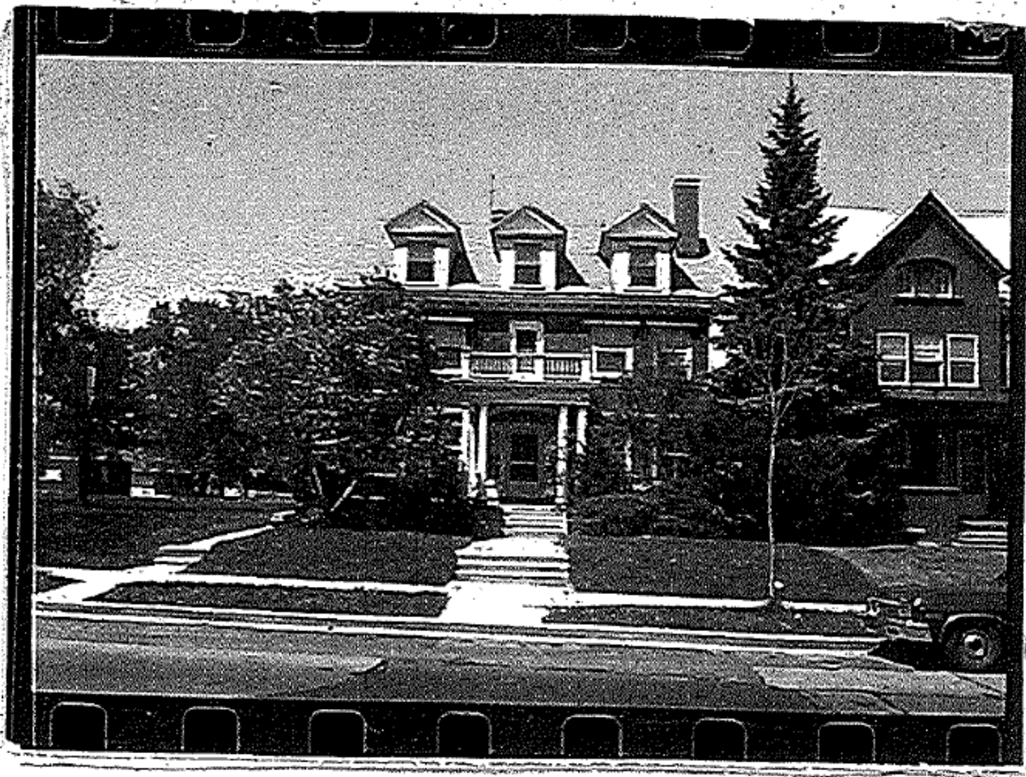
Survey photograph from 1979