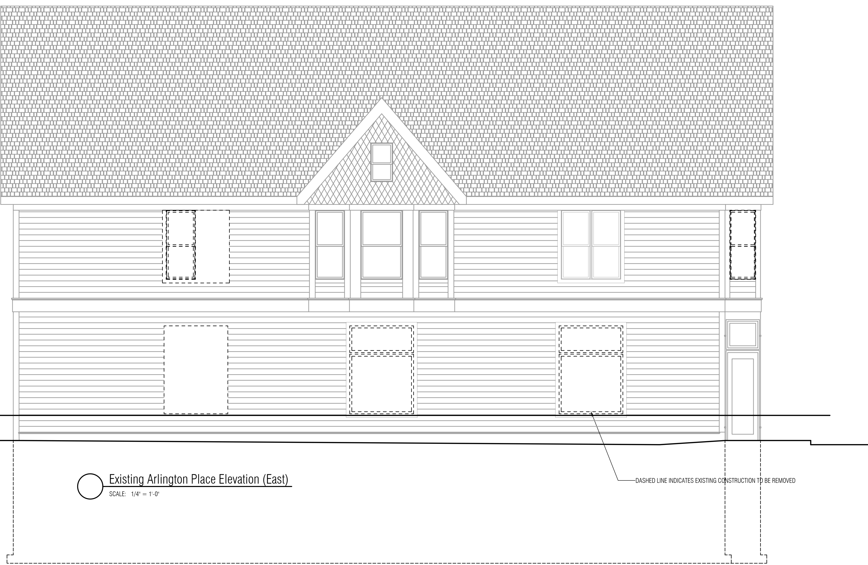
Existing Arlington Place Elevation (East) SCALE: 1/4" = 1'-0"