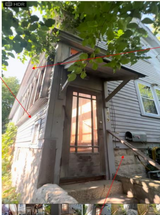
South Face of Rear House

Gutters repaired / replaced and properly connected to down spouts on Rear house north and south and noted.