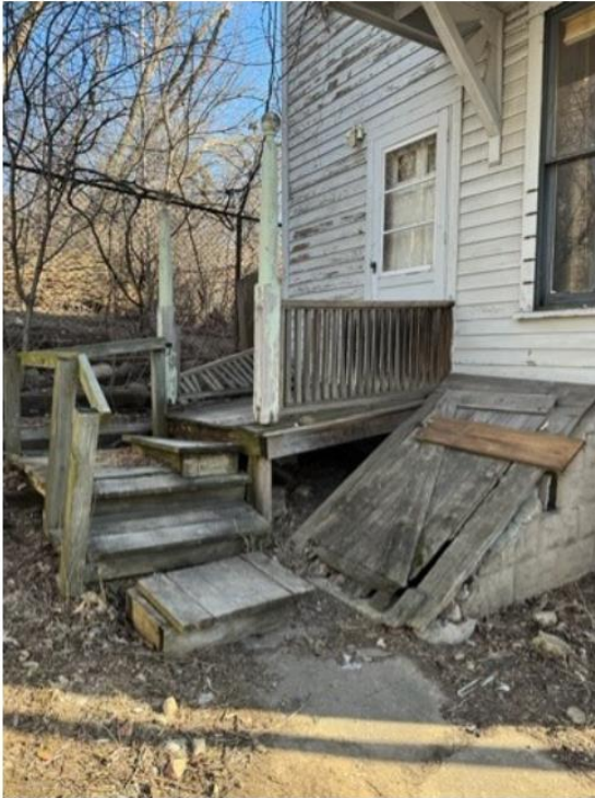
Existing Rear Porch Front house

Remove all of porch and supportive structure back to house facade