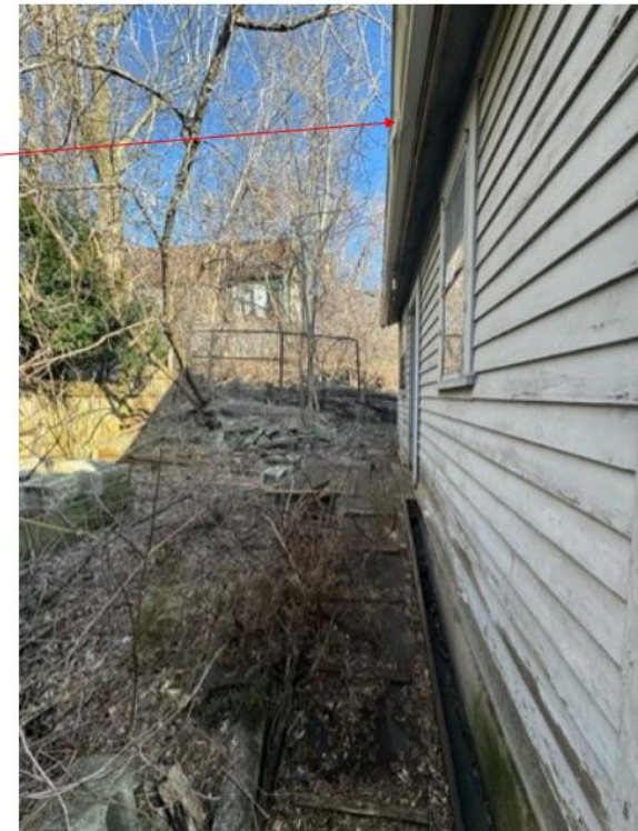
North Face of Rear House

Gutters repaired / replaced and properly connected to down spouts on Rear house north and south and noted.