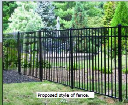
Proposed style of fence.

2635 W Greenfield Ave. Milwaukee, WI 53204