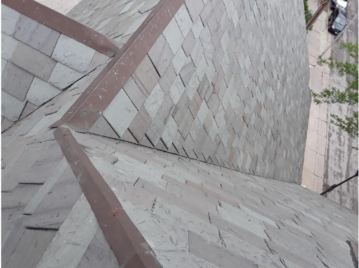
The current slate was installed about 10 years ago and the roof has failed. It is a mix of grey and green slate and not appropriate for this building.