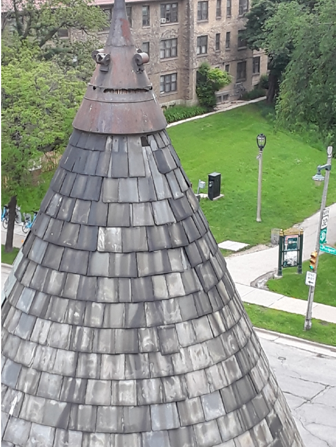
The finial on the tower is rusting away.