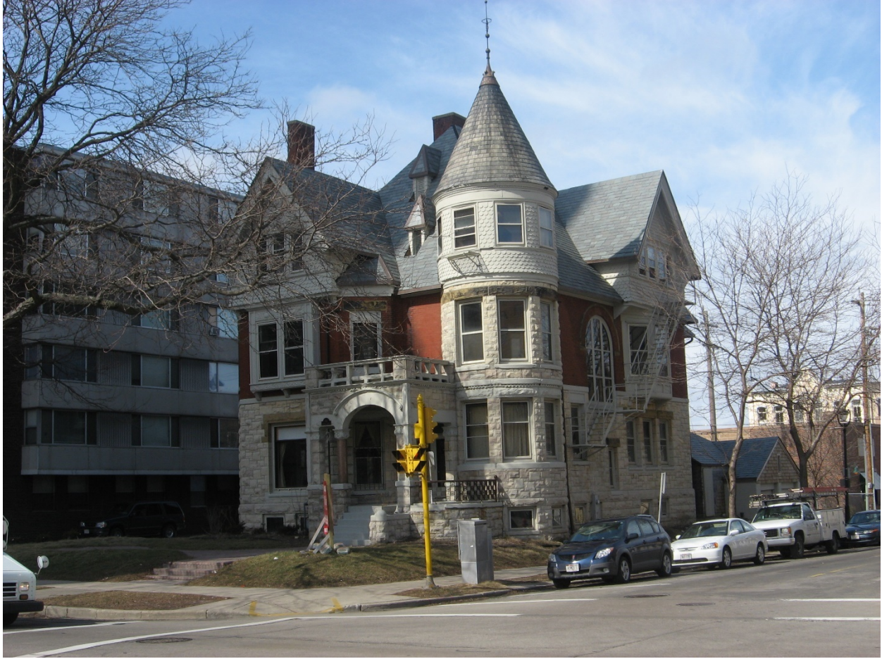
East and North Elevations