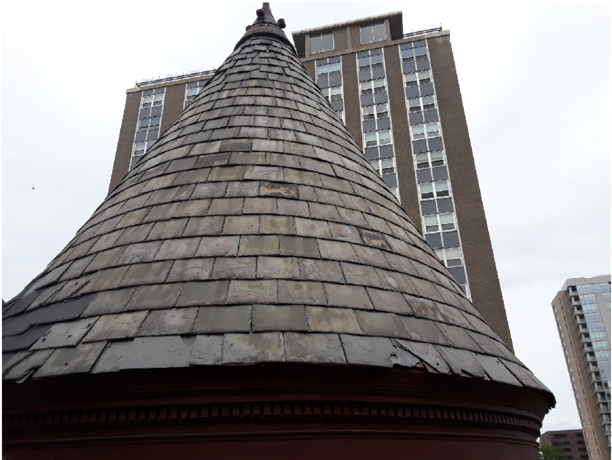
The new slate roof will match the original 1880 roof which is still on the tower. Buckingham Virginia slate will be used.