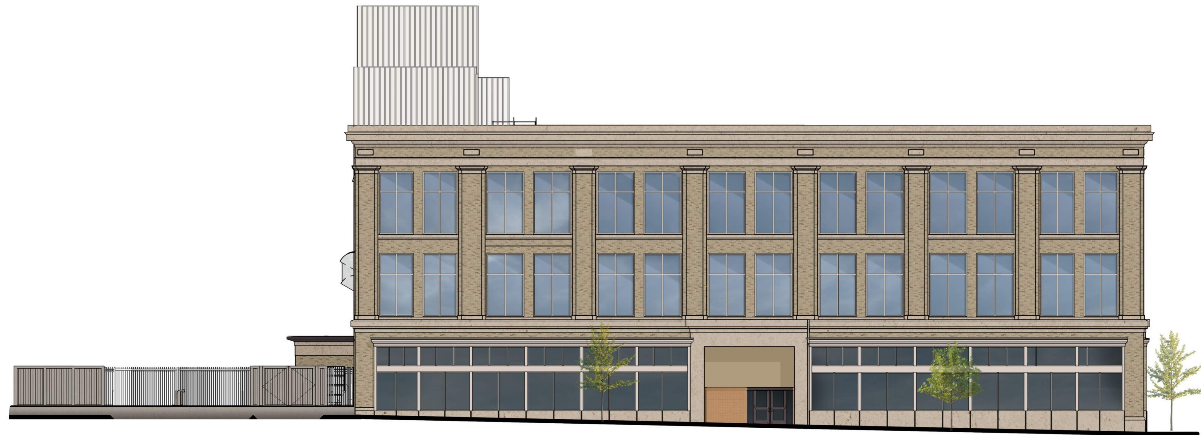
2 HPC-WEST ELEVATION SCALE: 3/32" = 1'-0"