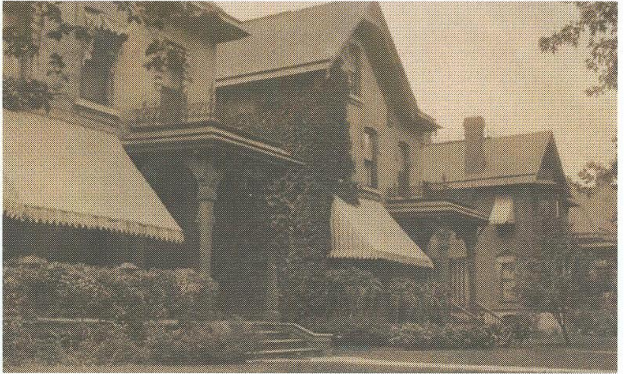
1879 North Cambridge (left) 1903 North Cambridge (right) with awnings