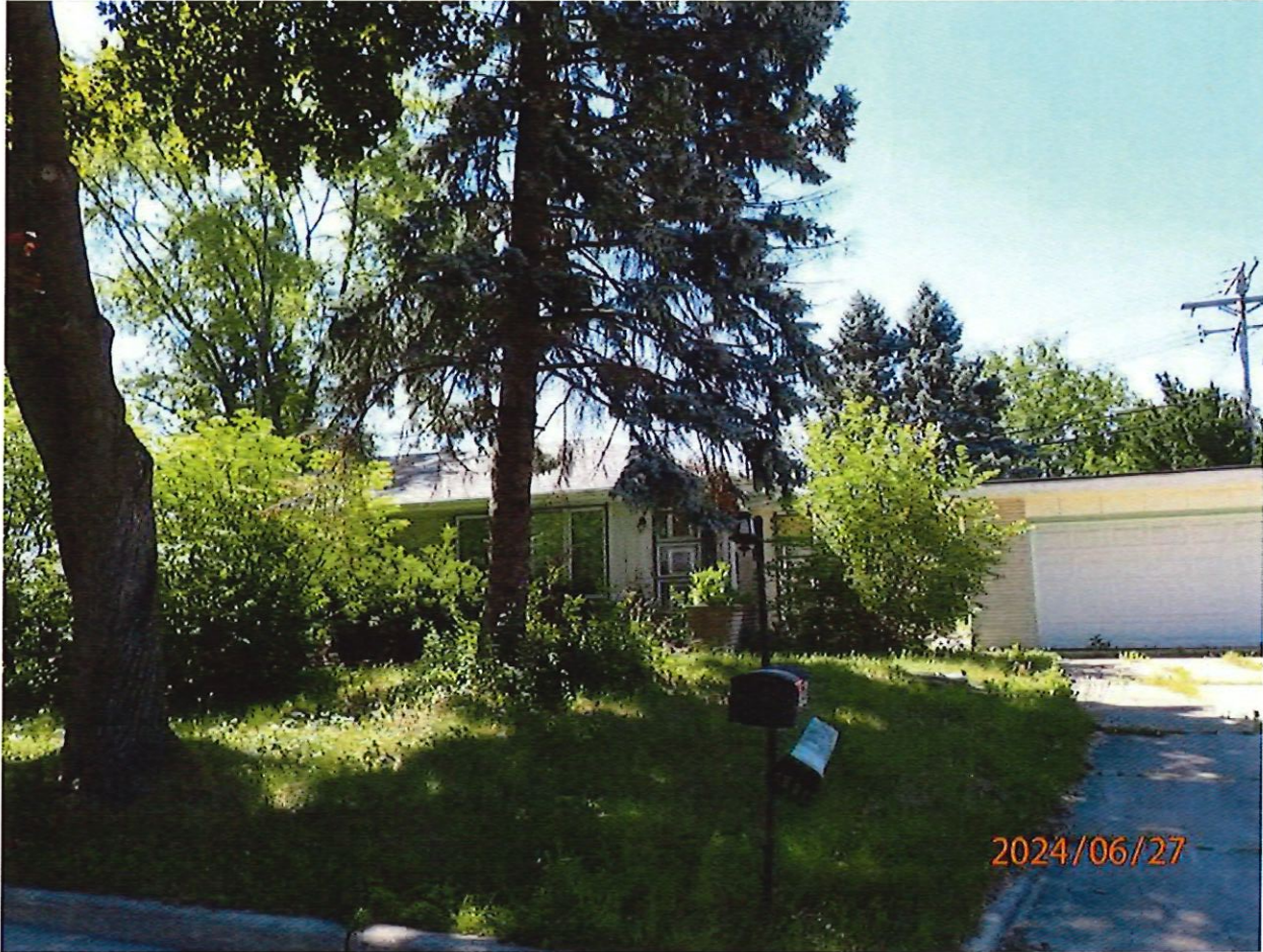
3401 W Wanda Ave Single-Family Home - VACANT Acquired: June 14, 2024