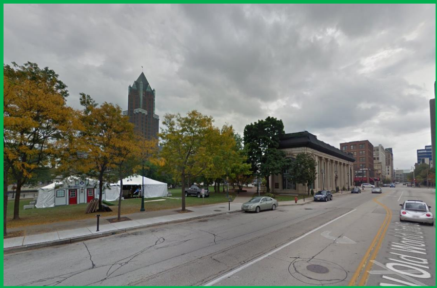
View from North Old World 3rd Street, looking southeast