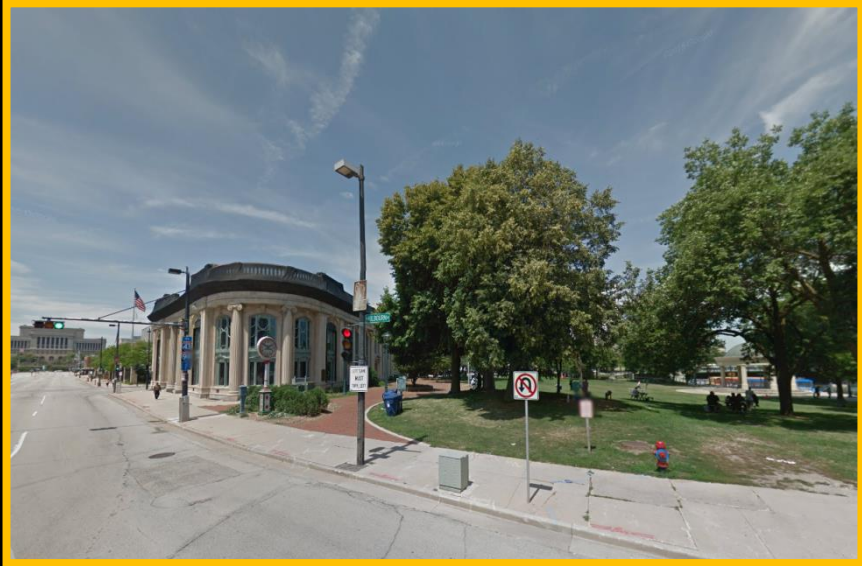
View from West Kilbourn Avenue, looking northwest