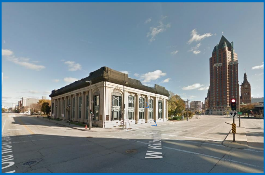
View from West Kilbourn Avenue and North Old World 3rd Street