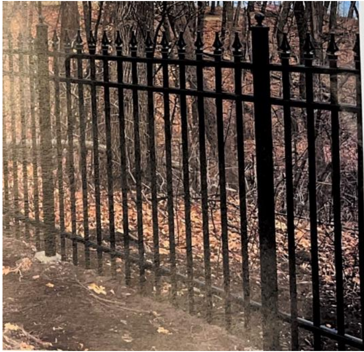
Metal fence style