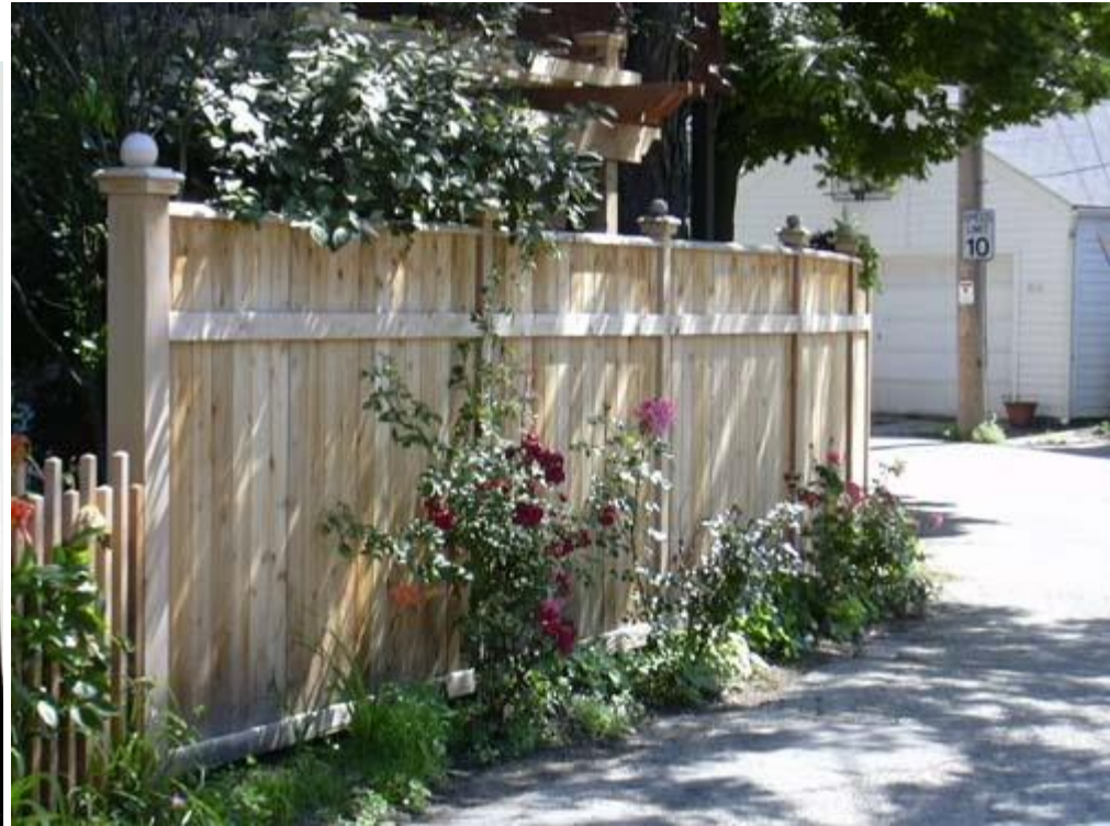
Wood fence to be this style or similar. Post-caps are not required.