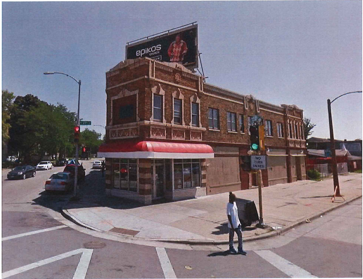
4360-64 North 27 th Street