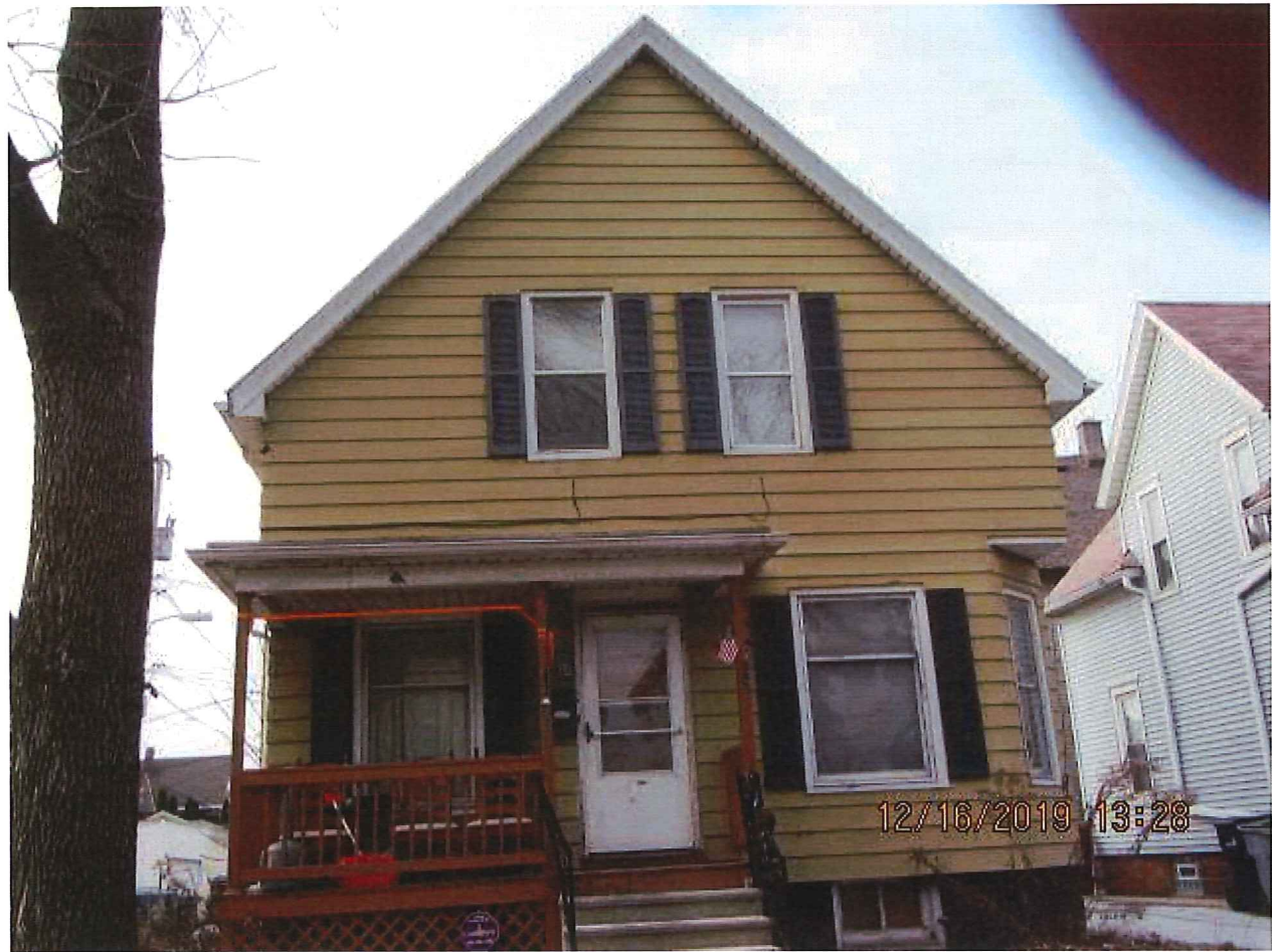
1113 South 37 th Street