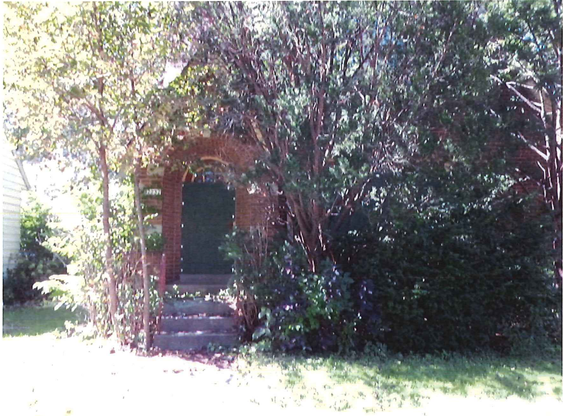
2237 W Olive Street