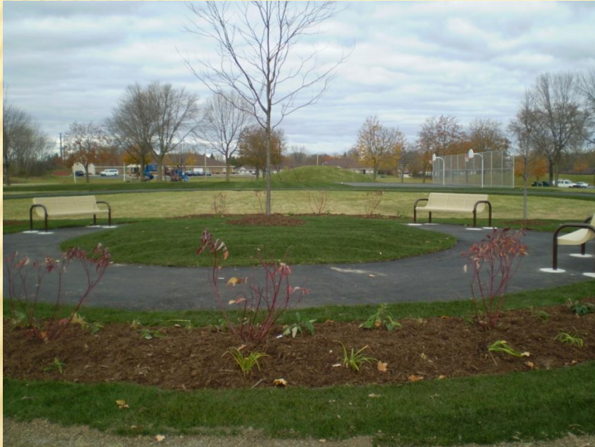
66 th and Port