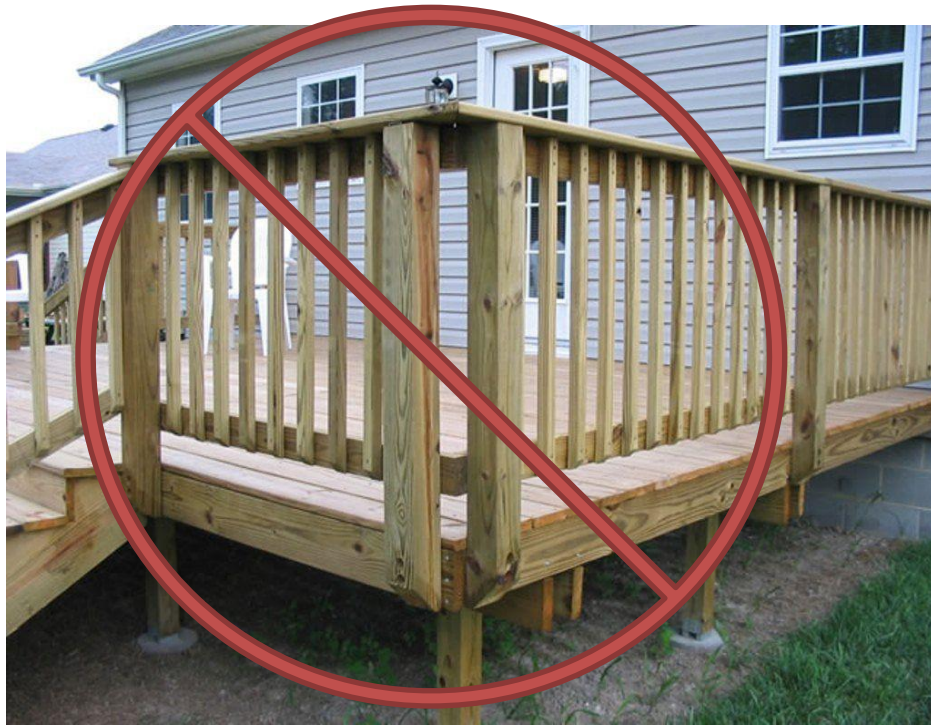
Example of inappropriate railing.