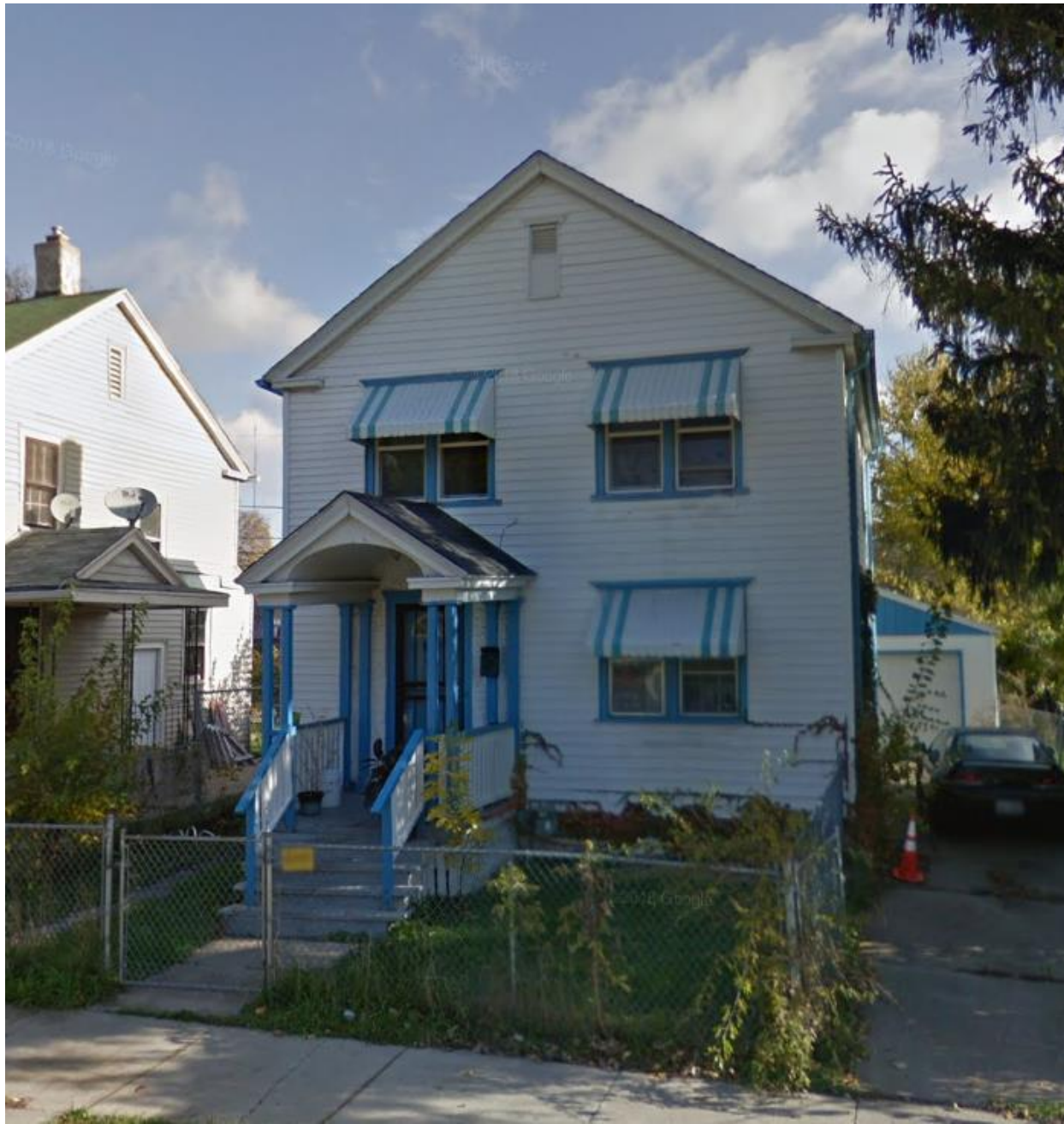
Current view of house.