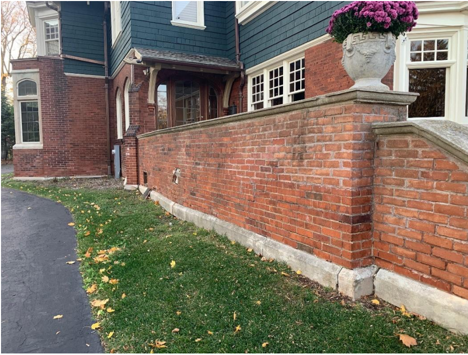
Bowing and settling on existing porch