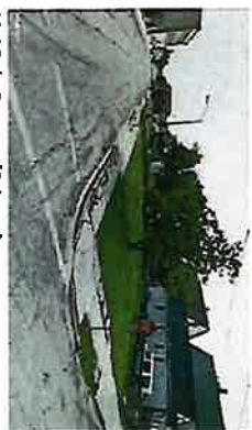
N 13th Street (3 Lots)