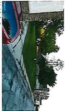
N 13th Street