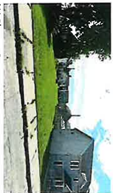
W Cherry St