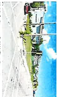
N 13th Street & W Vliet Street