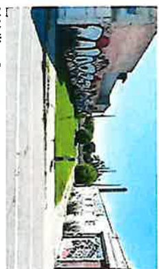
W Vliet Street