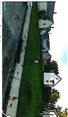
W Kneeland Street