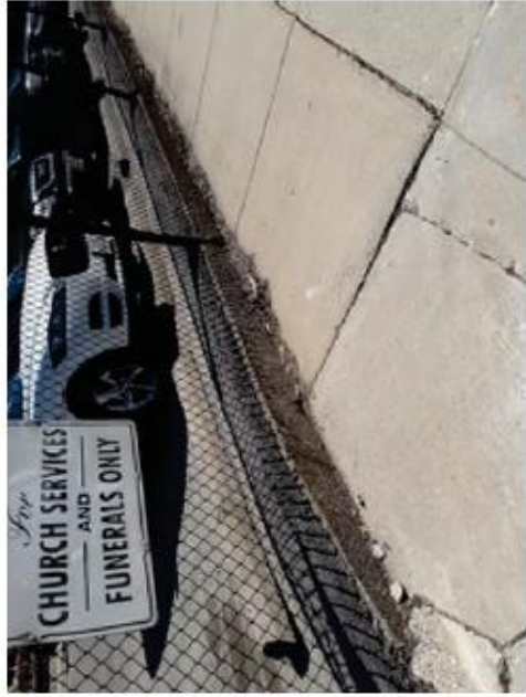
Existing Retaining Wall South of Repair Area- 7th Street