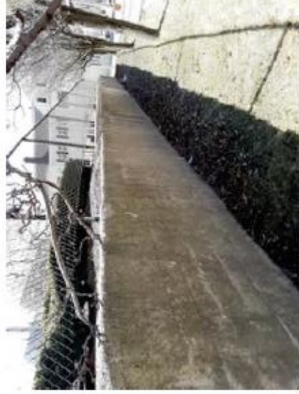
Existing Retaining Wall North / East of Repair Area- Lincoln Avenue