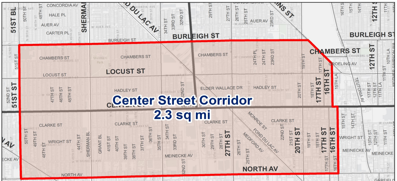
City of Milwaukee Violent Crime Map (2016)