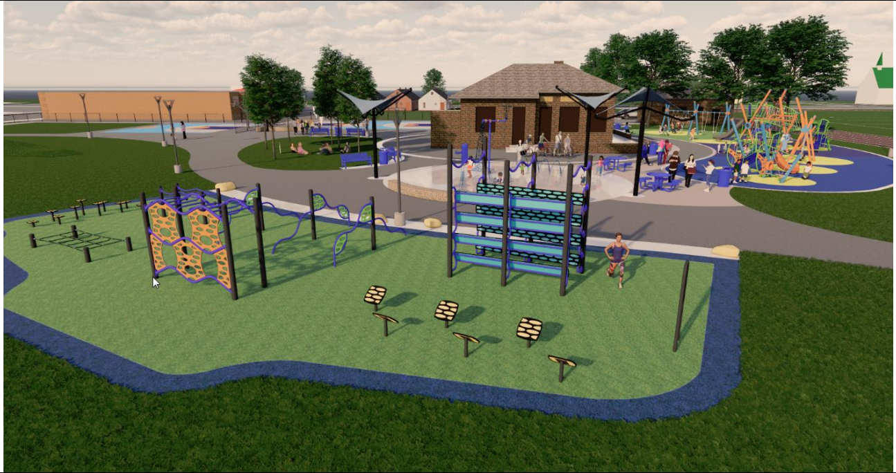
Franklin Playfield Obstacle Course