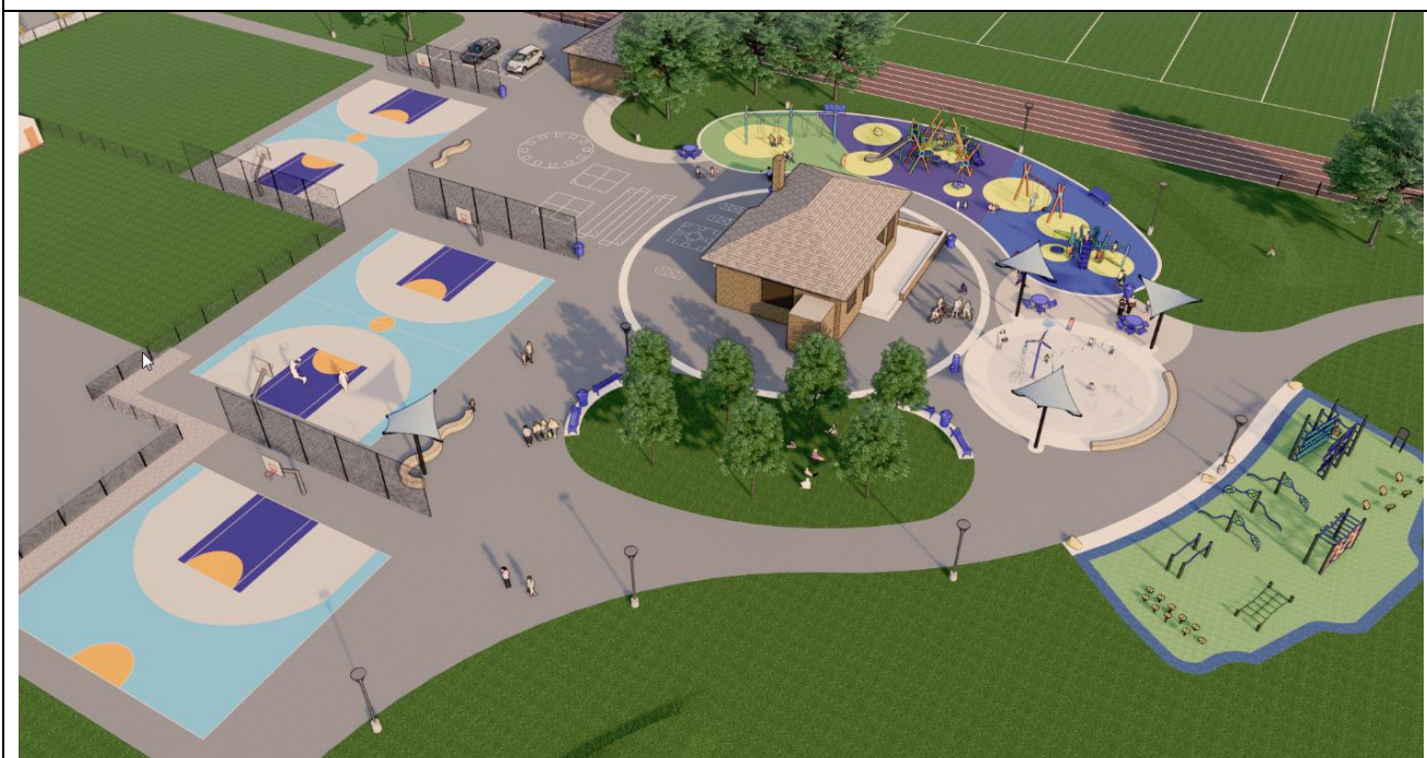
Franklin Playfield Improvements Birdseye View