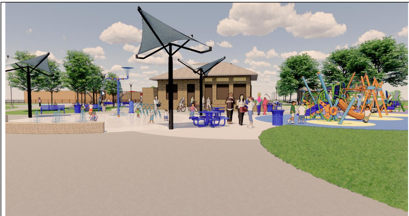
Franklin Playfield Splashpad