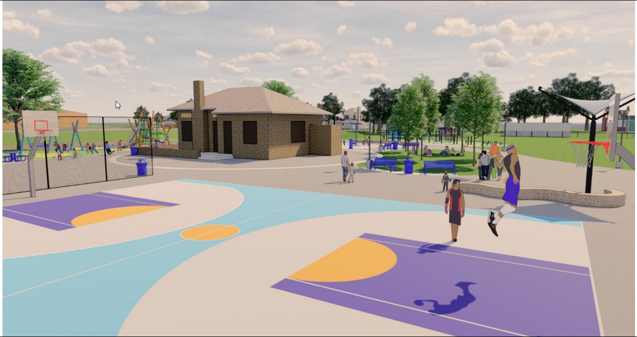
Franklin Playfield Basketball Courts