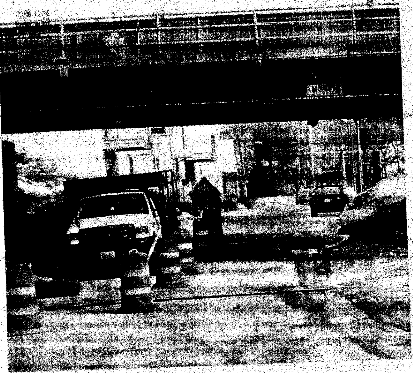
The truck from the ground.