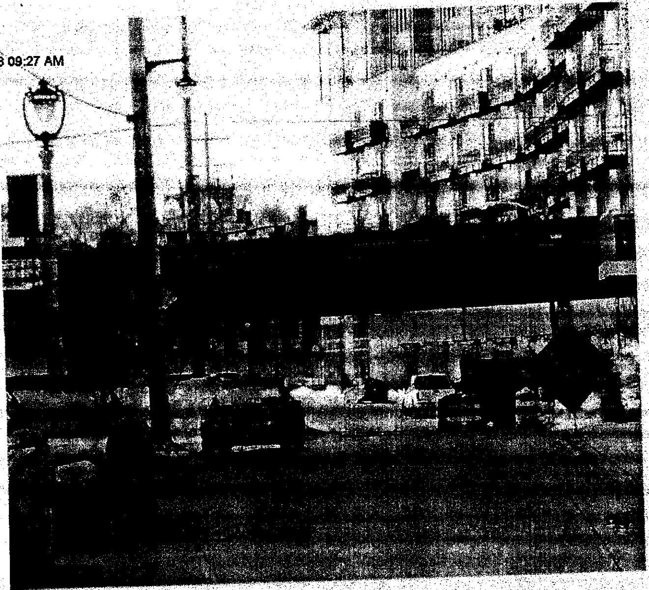
This is the west (opposite) side of the bridge, the side that we did not hit. Notice the height sign (not particularly prominent but at least it's there).