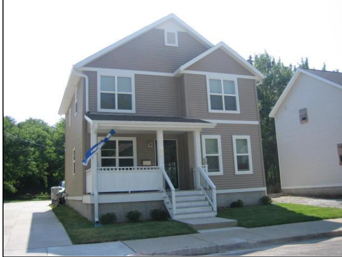
2008 "Willow" Model