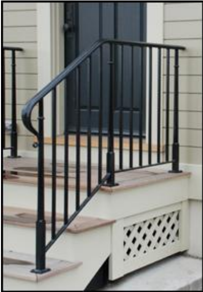
Metal railing option