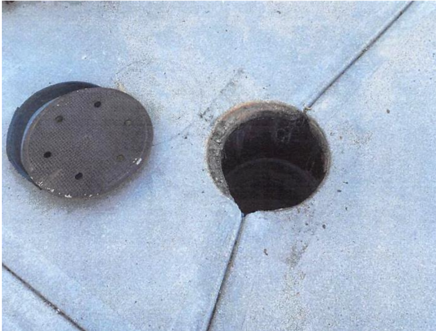
Existing sewer collar to be repaired