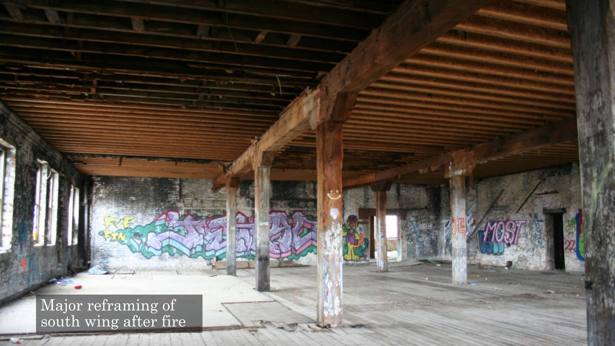
Major reframing of south wing after fire