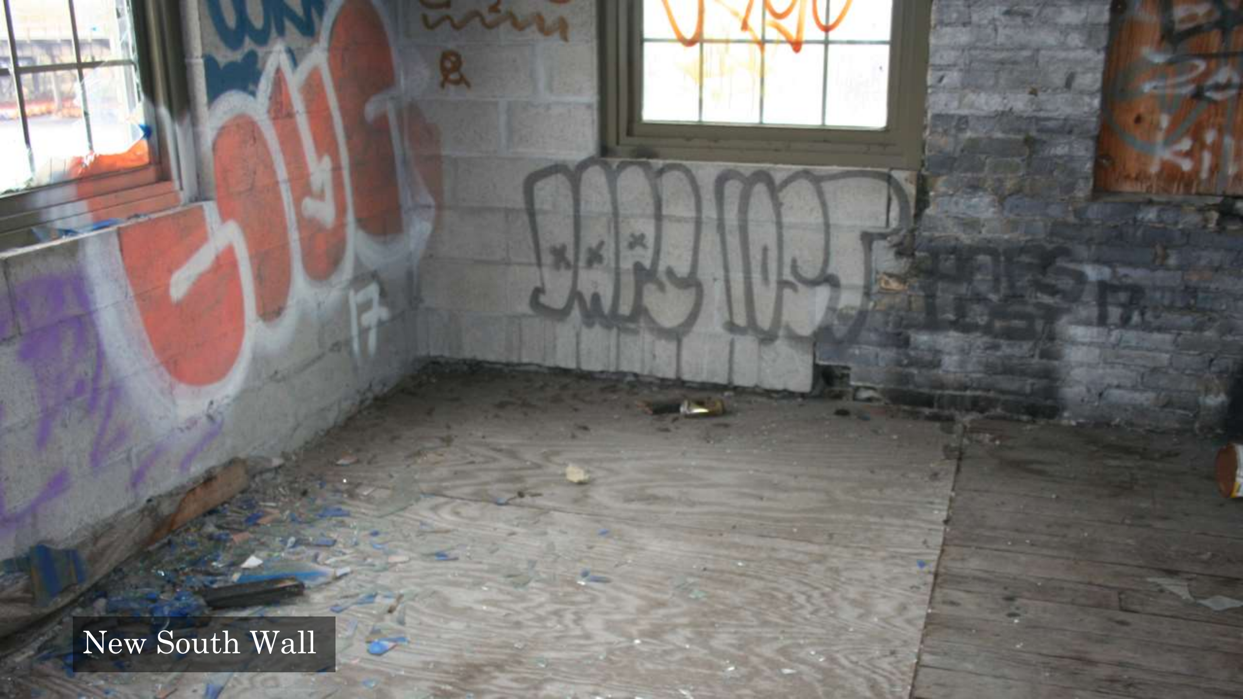
New South Wall