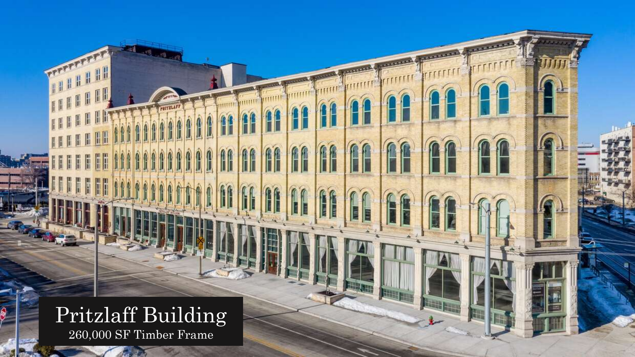
Pritzlaff Building 260,000 SF Timber Frame