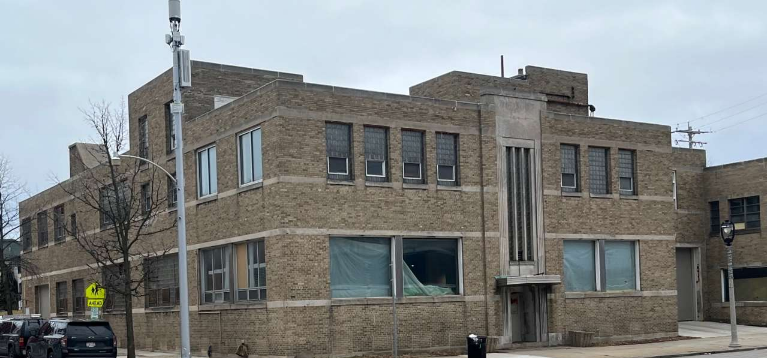
1633 E. North Ave 17 Apts. 35,000 SF