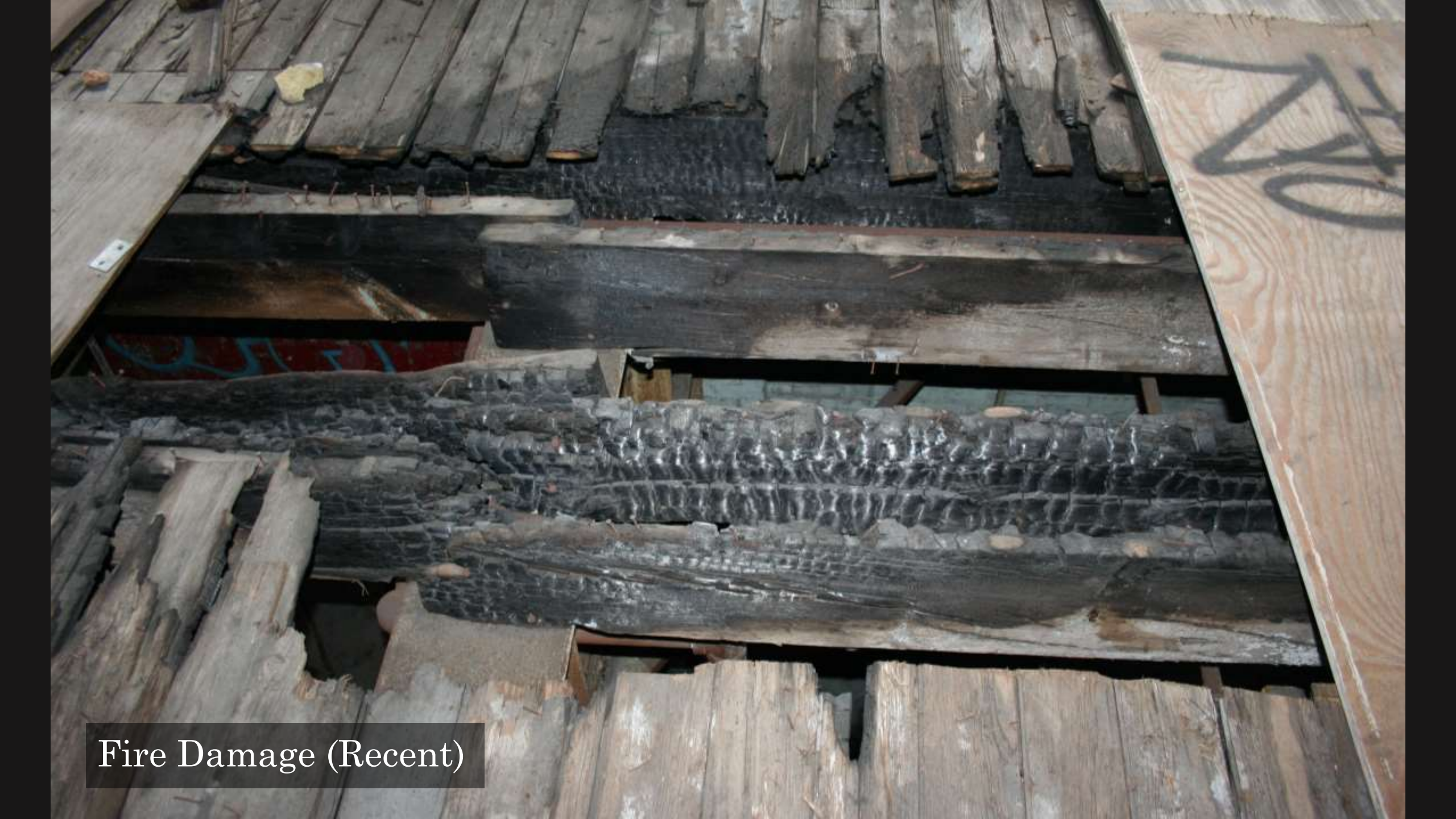
Fire Damage (Recent)