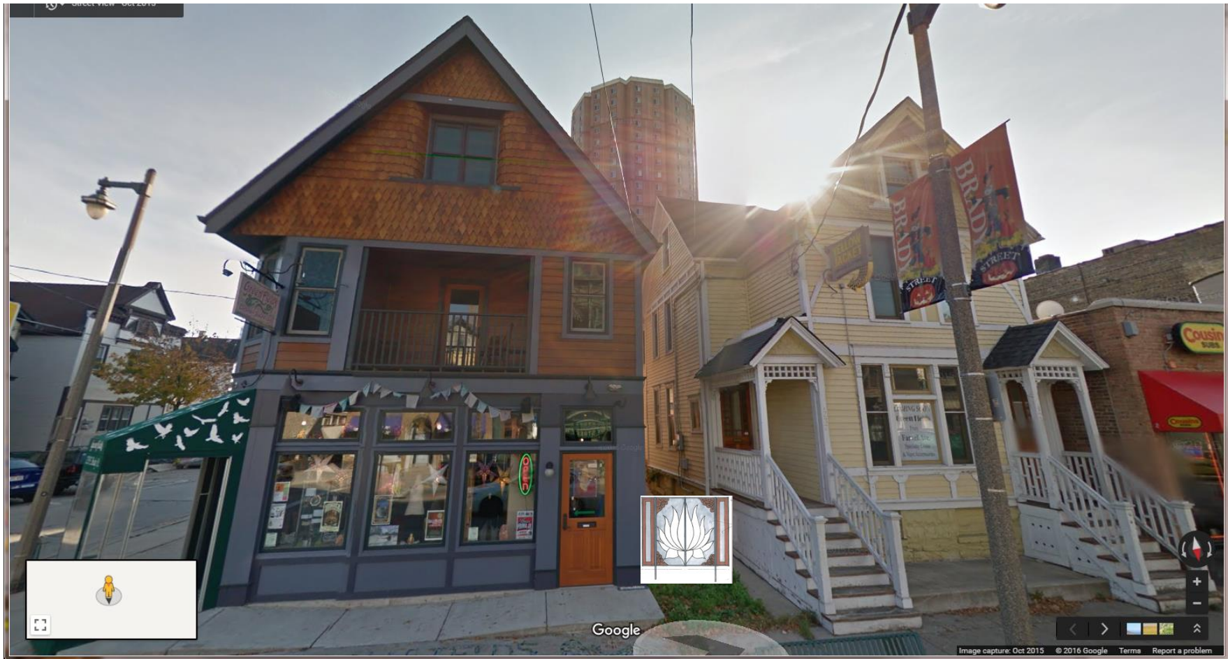
Mockup of gate in its approved location, not to scale.