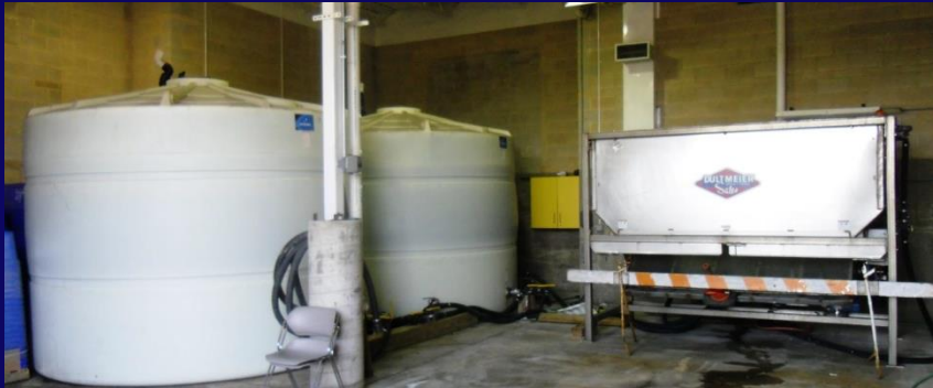
Current Manual Mixer