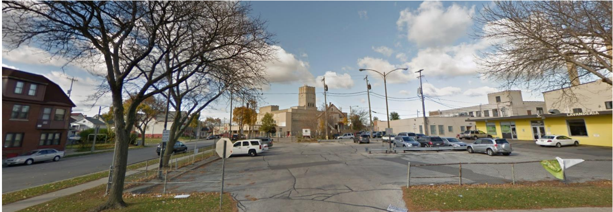
1747 South 12th Street, East Elevation (Older photo does not reflect current condition)

Property is surplus to municipal needs. If WHEDA application is successful, the property will be conveyed in “as-is, where-is” condition, with all faults, environmental concerns and subsurface conditions, known and unknown, solely the responsibility of the buyer entity.