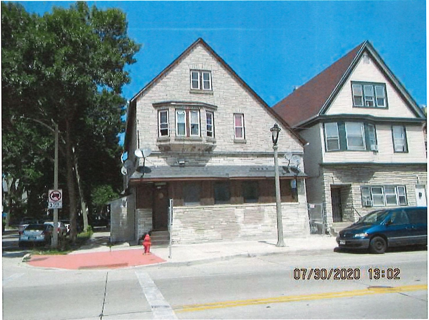
1932-34 W Greenfield Ave