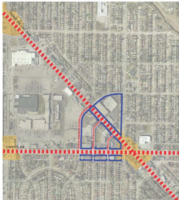
Figure 5-2. Midtown Gateway Area

GATEWAY ZONES: MIDTOWN AREA (CAPITOL DR, 51ST ST, FOND DU LAC AVE, 60TH ST)