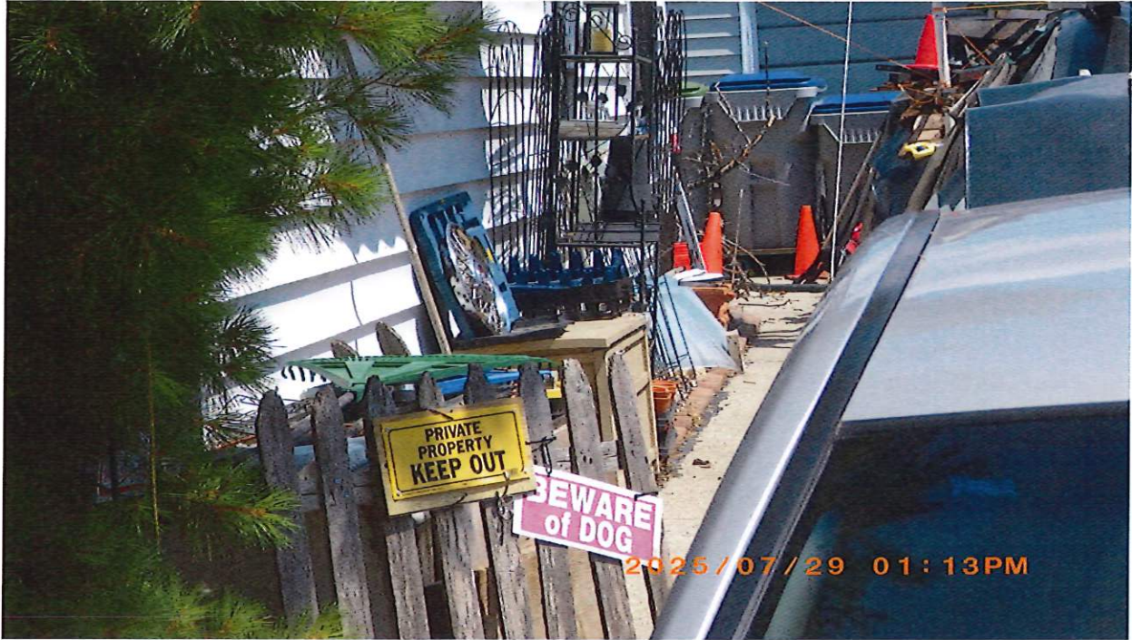
3536 N 93rd Street. (7/29/2025) (ORD-25-07687. Violation # 2)