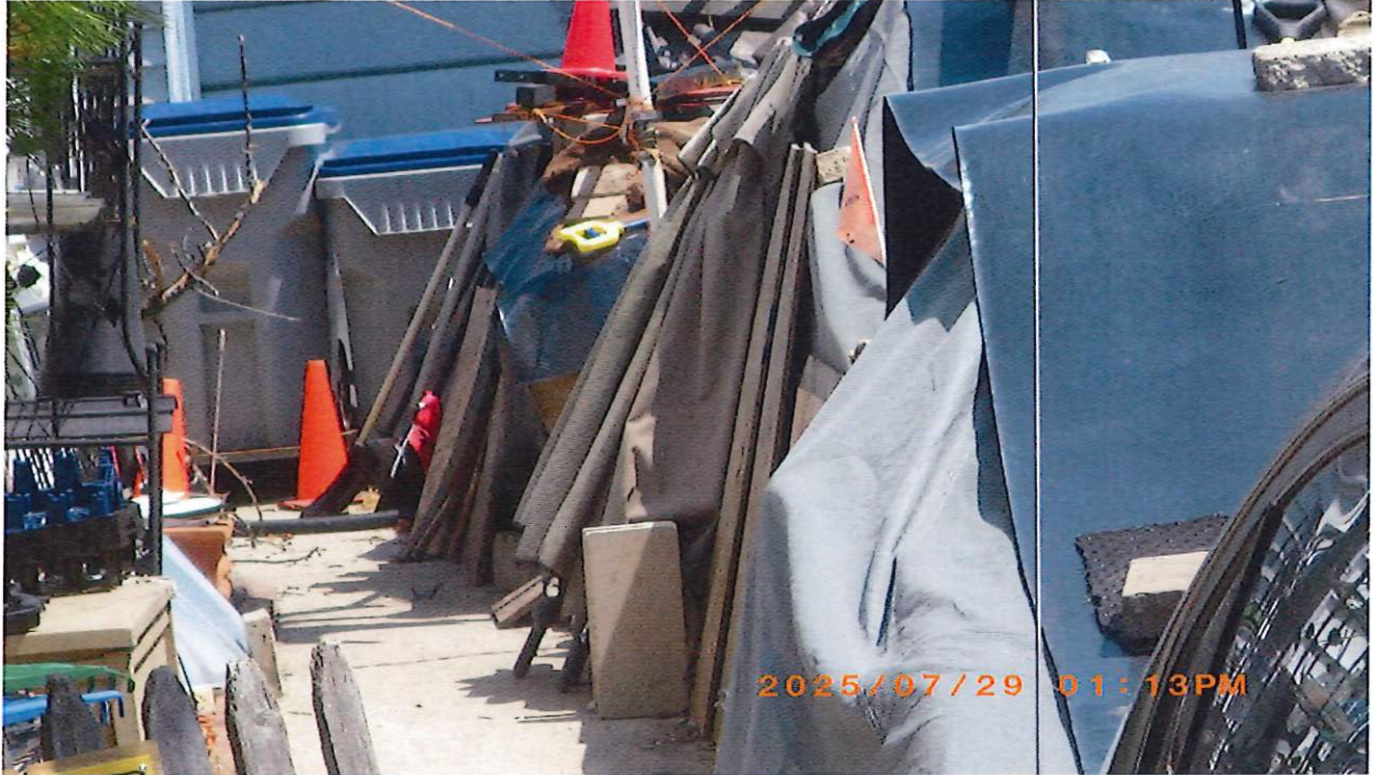
3536 N 93rd Street. (7/29/2025) (ORD-25-07687. Violation # 2)