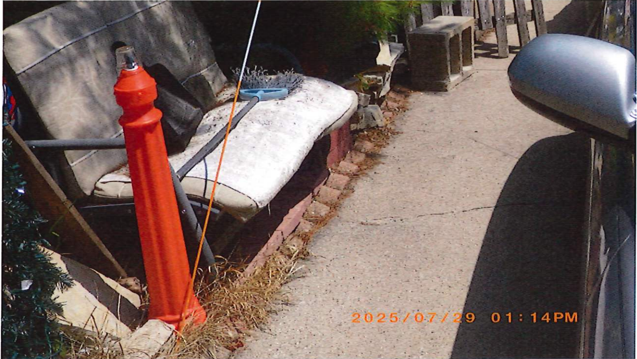
3536 N 93rd Street. (7/29/2025) (G. Armstrong/ Special Enforcement) (ORD-25-07687. Violation # 2)