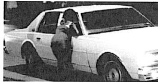
Street prostitution thrives along roads where prostitutes can talk to drivers from the curbside.

(/problems/street_prostitution/endnotes/#endnote21) These places are often near the street where the negotiation occurred so that the amount of time required for each transaction is limited. Most are out of sight of passersby but not so secluded that prostitutes will be unable to attract attention if they need help.