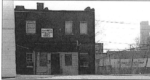
Street prostitution often thrives in areas where there are cheap motels and hotels.