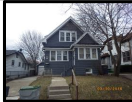
Compliance Loan Program