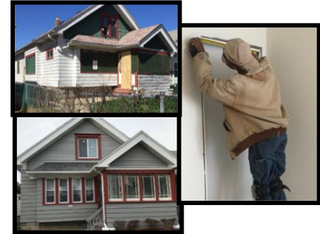
MERI Project – Strong Blocks