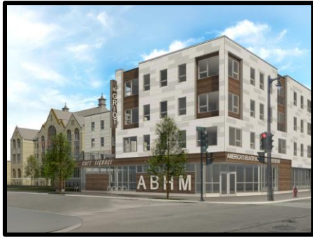
The Griot – new affordable housing units (opened June 2018)