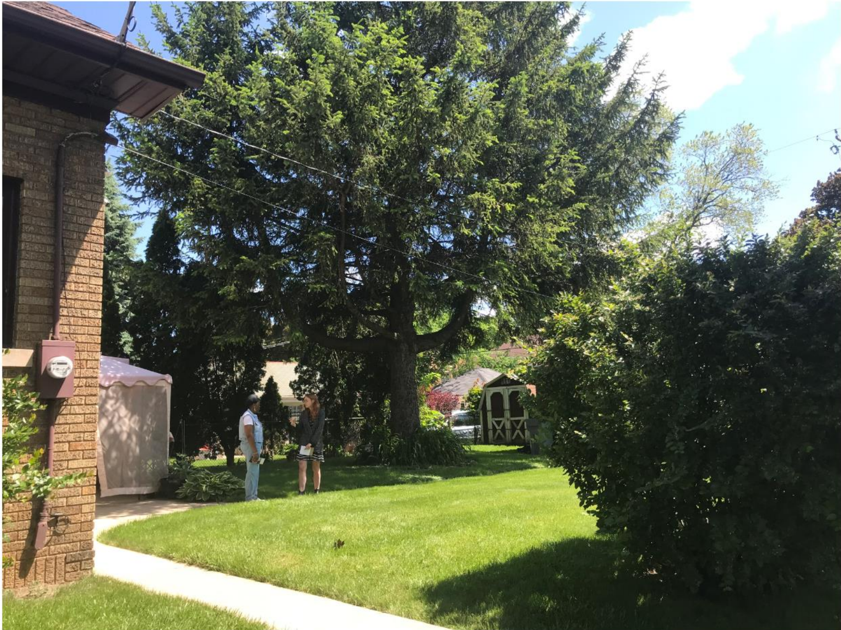
View of backyard where pergola will be sited – view has since been obscured by the installation of a fence/gate approved last month