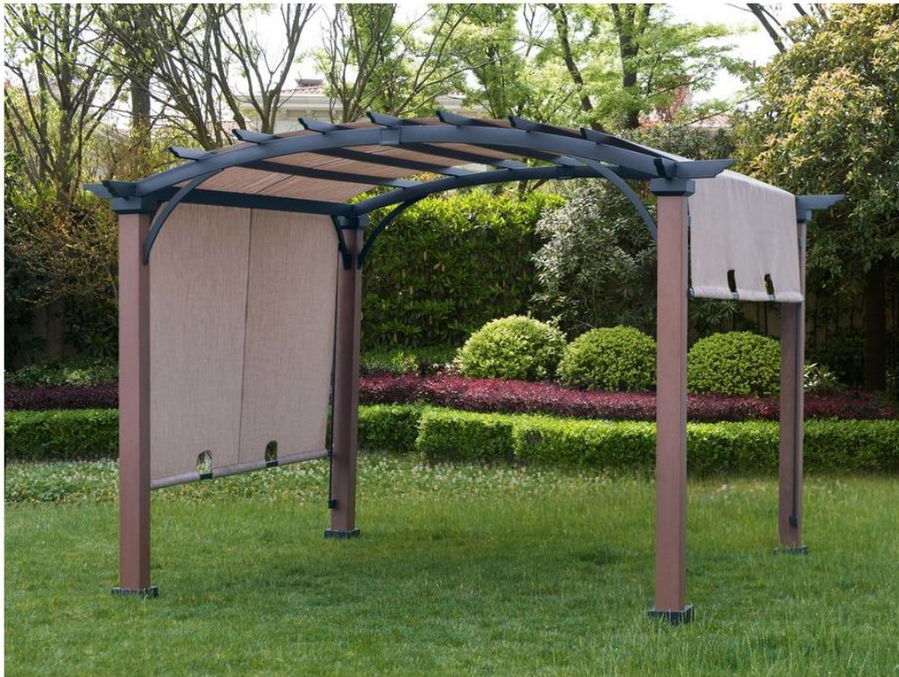
Rendering and photograph of the proposed metal and wood pergola