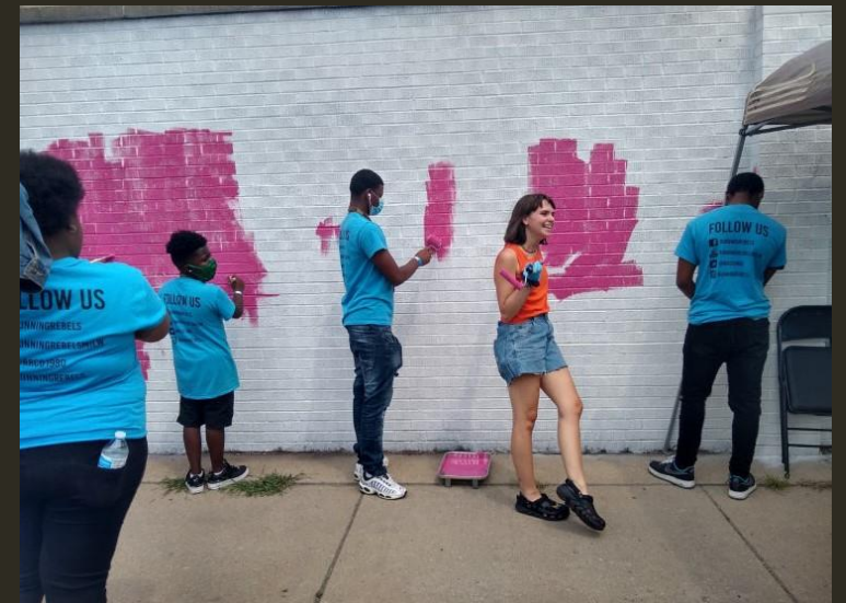
Artists Working in Education members beginning work on a community-based mural, 2021

Budget - The total budget for the Artist Services for the Public Artist in Residency pilot is $43,000 in Artist fees, including reimbursable expenses, and $25,000 for all costs associated with the development and implementation of the project.