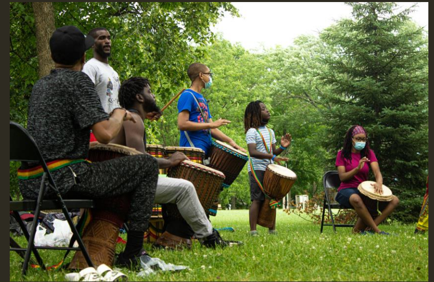
Ko-Thi Adult Ensemble and Ton Ko-Thi Musicians welcome community members at Ko-Thi Around Milwaukee in Sherman Park, 2022