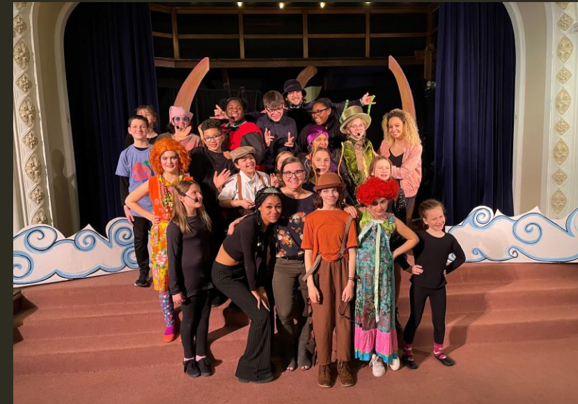
Cast & Crew Members of Milwaukee Youth Theater's production of James and the Giant Peach, 2022