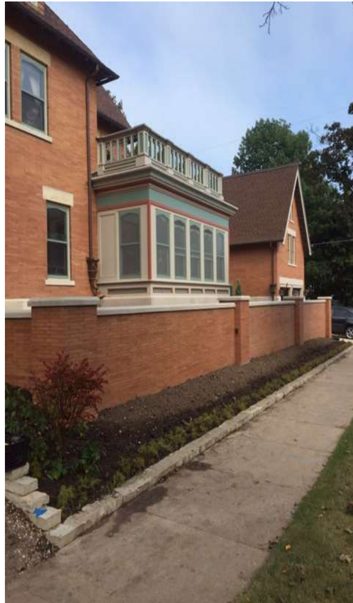
View of planting area between sidewalk and wall.