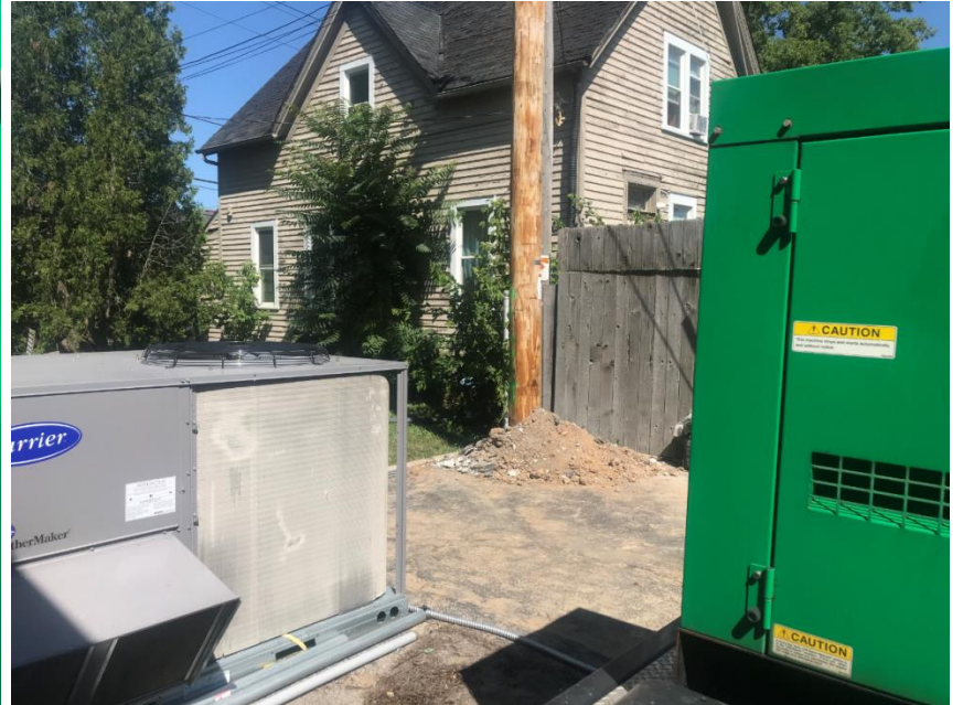
Photographs of the newly installed HVAC equipment at the northwest corner of the property, to be concealed by 6' wood privacy fence