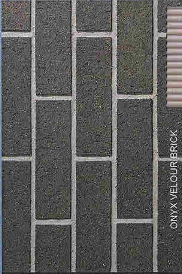
ONYX VELOUR BRICK