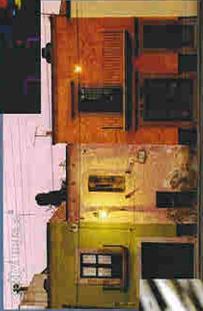
BREAKING DOWN THE SCALE