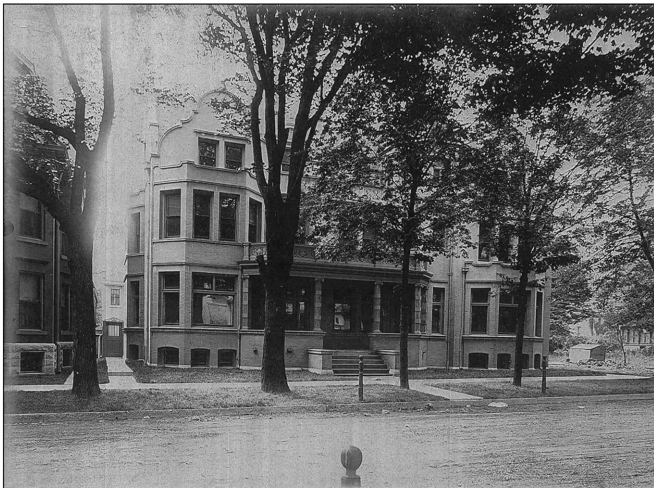
Undated historic photograph of the Koeffler-Baumgarten Double House, 817-819 North Marshall Street, Milwaukee.