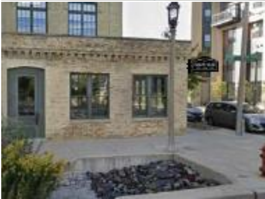
(Bottom: Example of Placement)