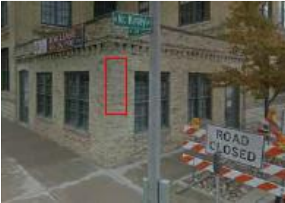
(Top: Sign Location)