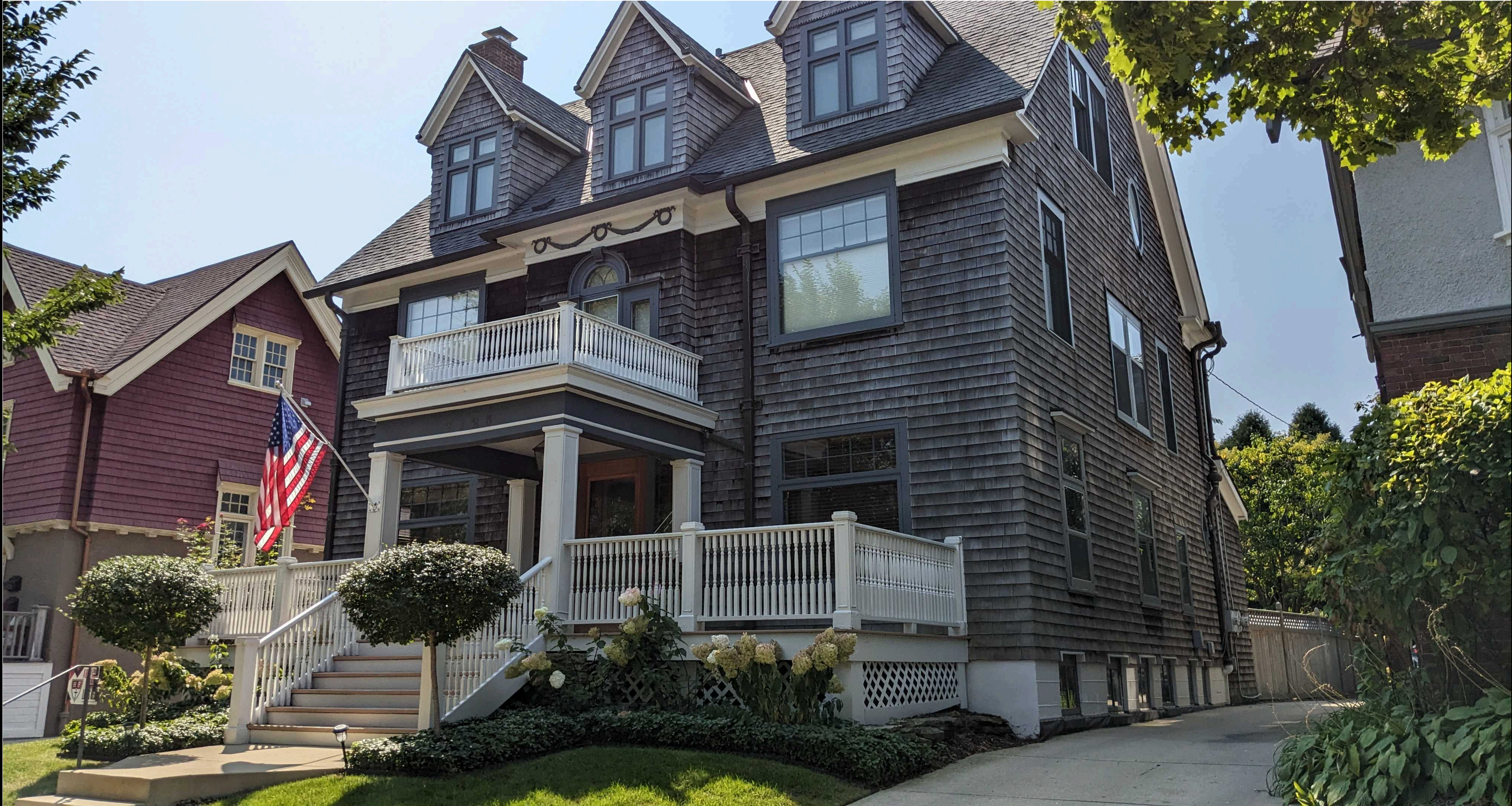
RIGHT / WEST SIDE VIEW (NO WORK)