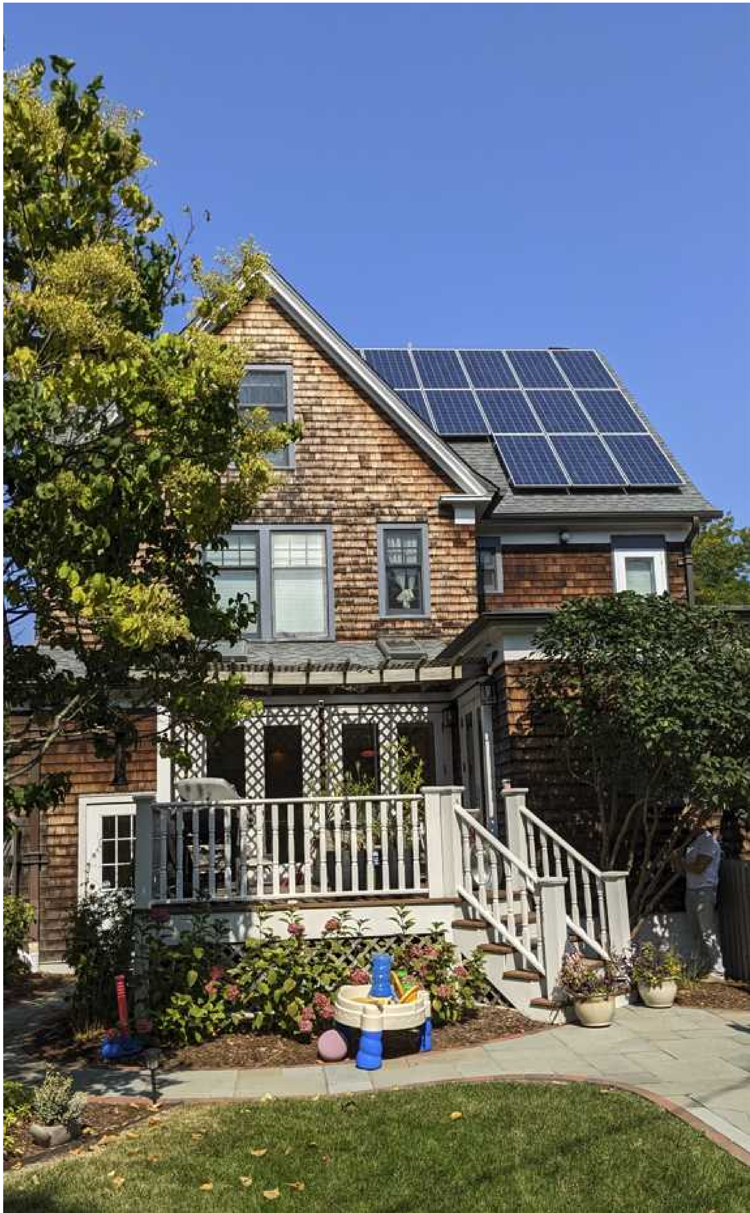
REAR / SOUTH VIEW