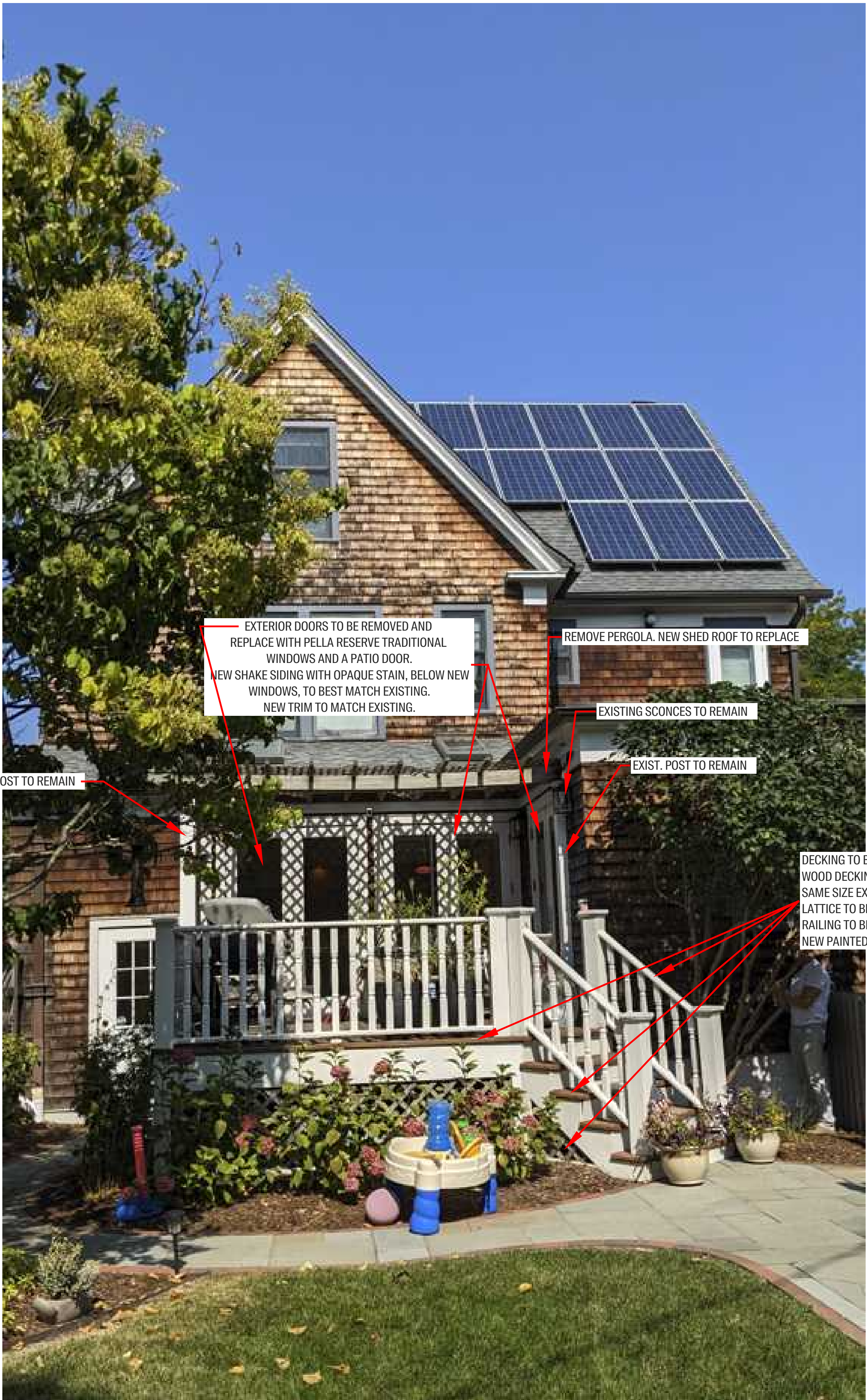
REAR / SOUTH VIEW WITH NOTES