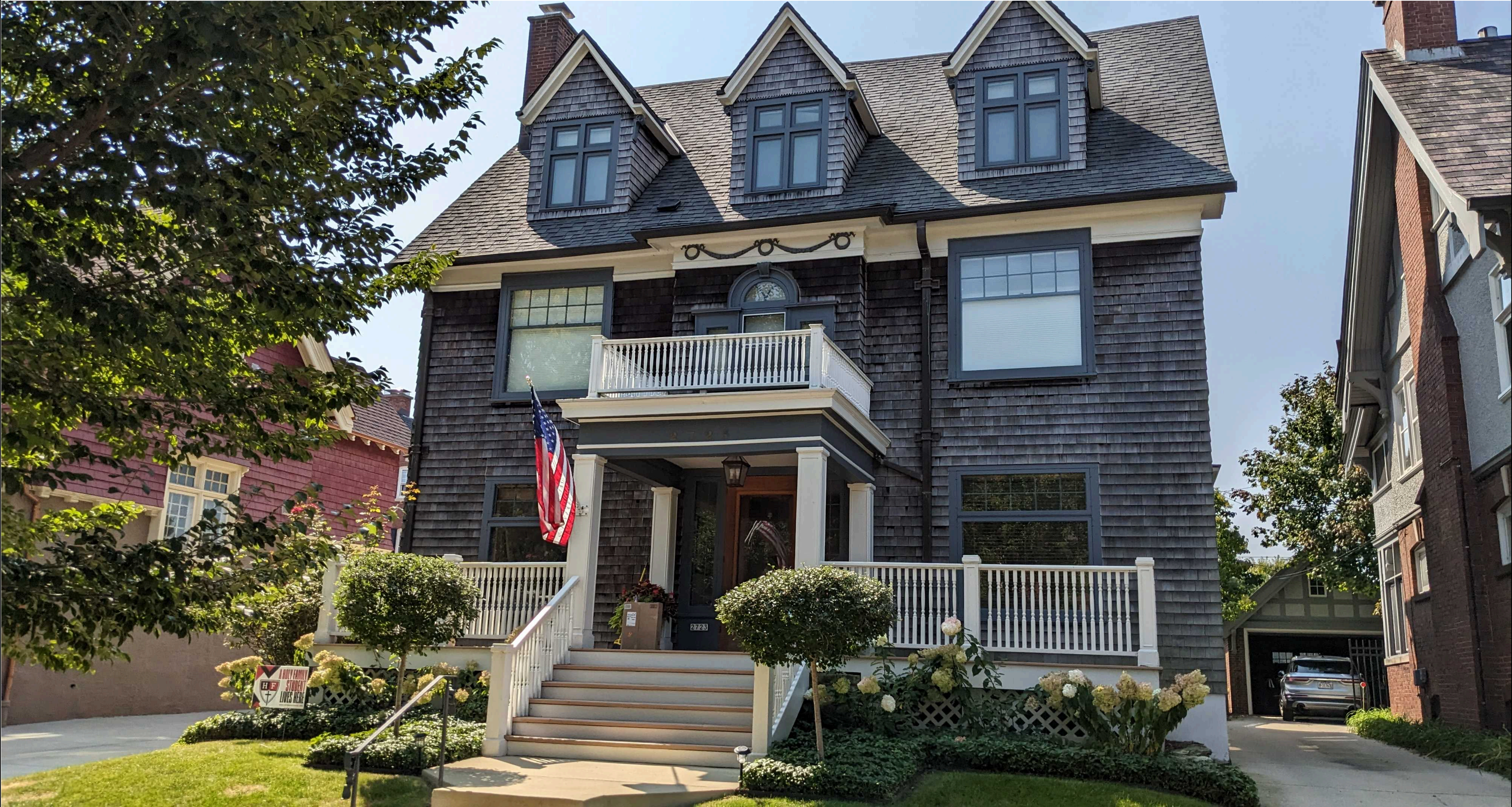
FRONT / NORTH VIEW (NO WORK)