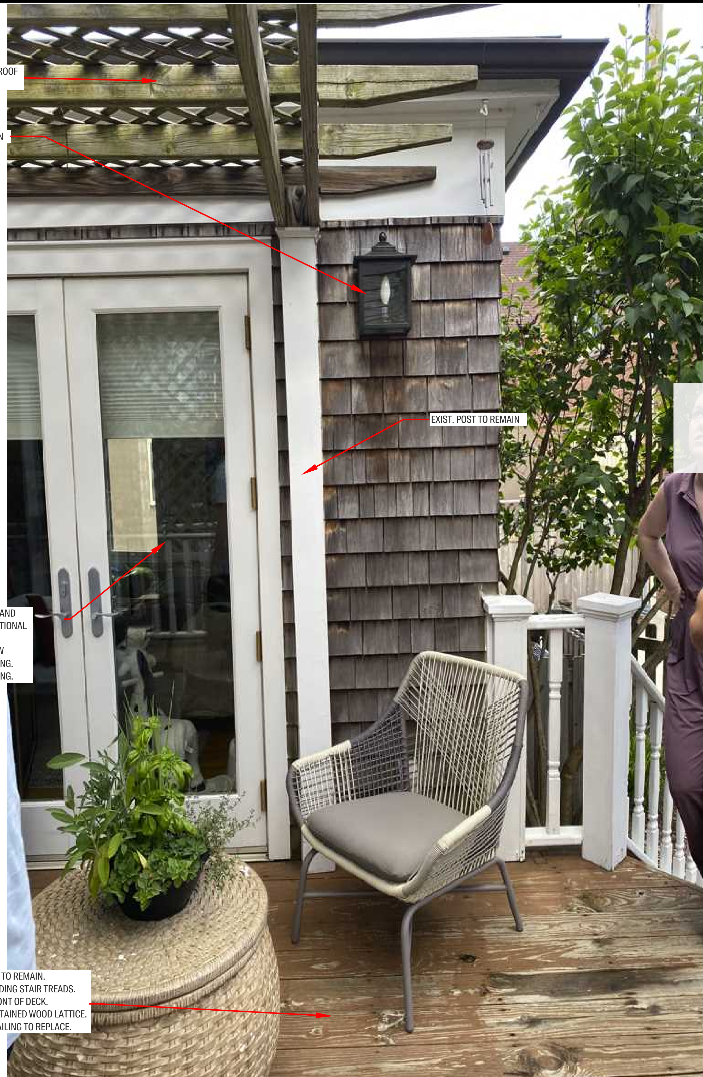
INSIDE CORNER - WEST FACING WALL

DECKING TO BE REMOVED BUT STRUCTURE TO REMAIN. NEW STAINED WOOD DECKING TO REPLACE. INCLUDING STAIR TREADS. SAME SIZE EXCEPT 3'-0" EXTENSION AT FRONT OF DECK. LATTICE TO BE REMOVED AND REPLACED WITH NEW STAINED WOOD LATTICE. RAILING TO BE REMOVED. NEW PAINTED WOOD RAILING TO REPLACE.