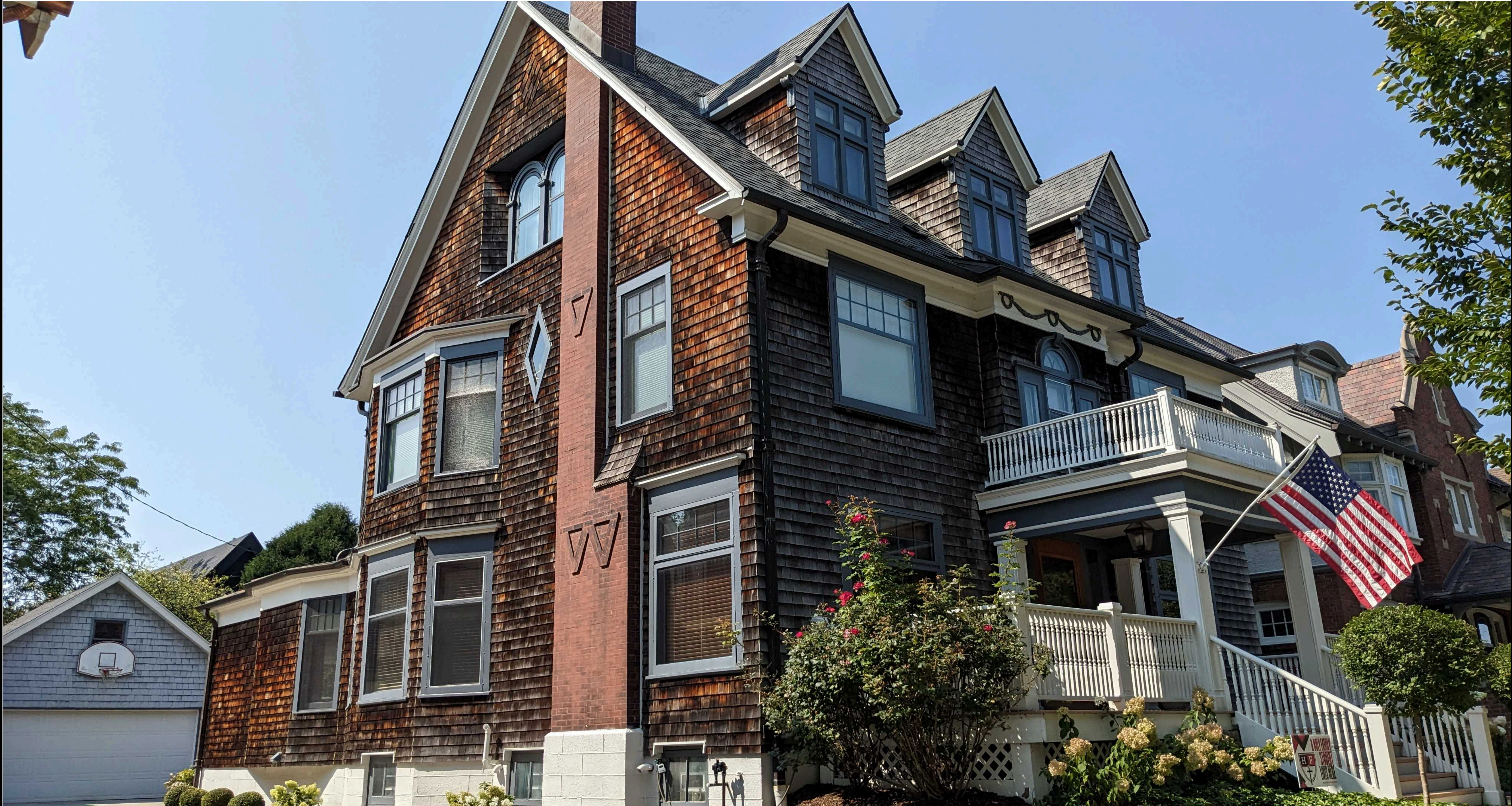
LEFT / EAST SIDE VIEW (NO WORK)