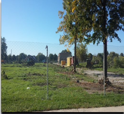
St. Ann Development