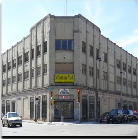
Milwaukee Mall (Work in Progress)