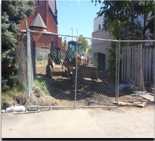
Hope School Expansion