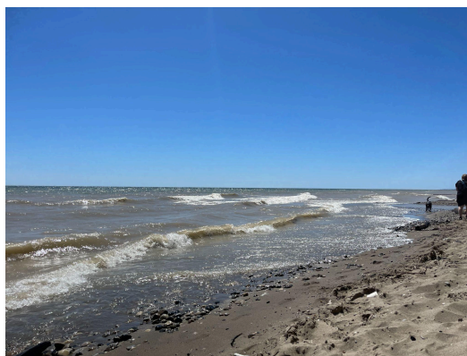
Left: Galway Bay, Right: Lake Michigan

Furthermore, the City of Milwaukee benefits from our relationship with our Sister City through tourism dollars. Our guests from Galway stay in Milwaukee, visit our many attractions, and spend their tourist dollars right here in the city. They make a point to comment that the Milwaukee atmosphere makes them feel right at home, even if they are across the ocean. On the Saturday night of our festival, we host an annual Tourism Ireland luncheon for festival organizers from all across North America to network and plan their festivals. This luncheon is key for developing connections and plans for expansion of tourism in all regions that attend.