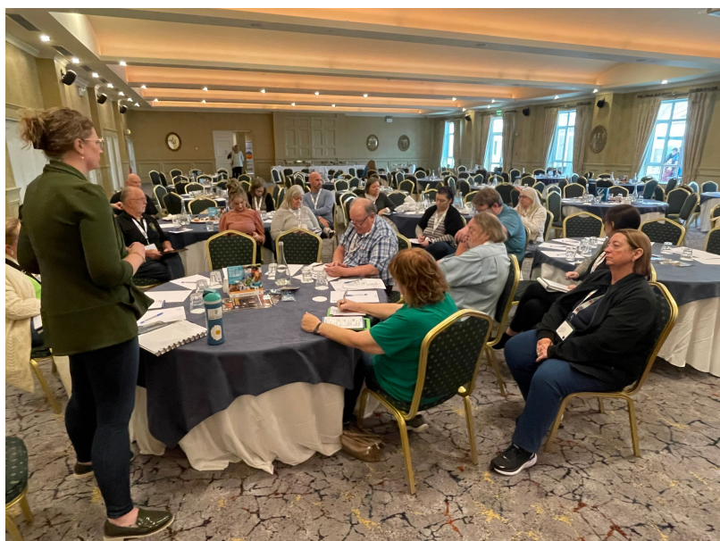
Attendees at the Association of Irish and Celtic Festivals Conference in 2023, hosted by CelticMKE in Galway, Ireland partake in a breakout session about year-round programming