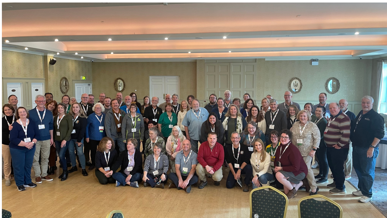
Attendees at the Association of Irish and Celtic Festivals Conference in 2023, hosted by CelticMKE in Galway, Ireland