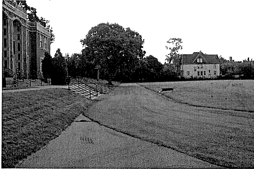
View from 33 rd Street Looking East. Fence will be directly in front.