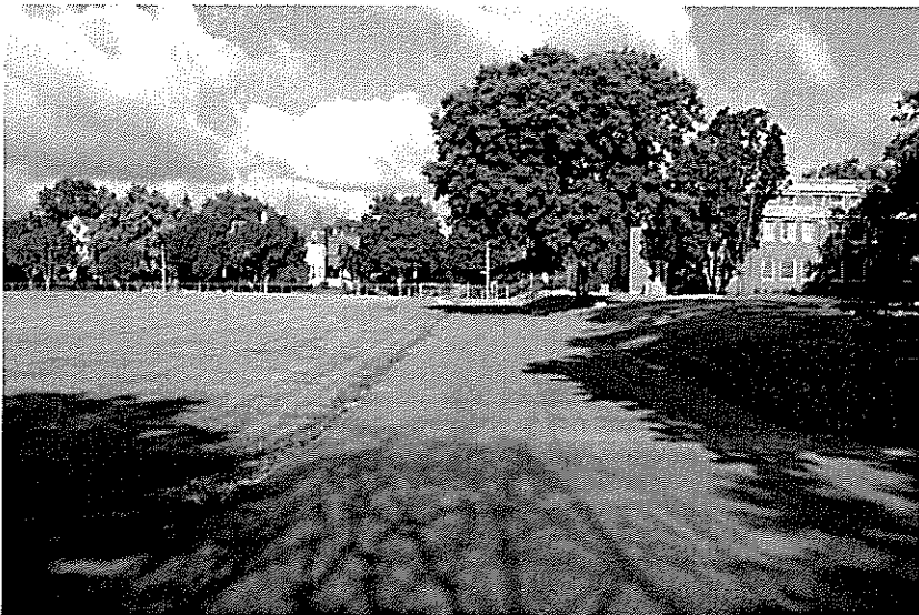
View from East edge Looking West. Fence will replace fence shown from building on right to a bit beyond edge of pavement on left.