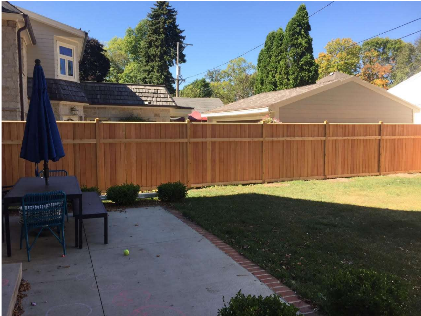
Approved fence design. Fence shall be painted or stained (opaque stains preferred).