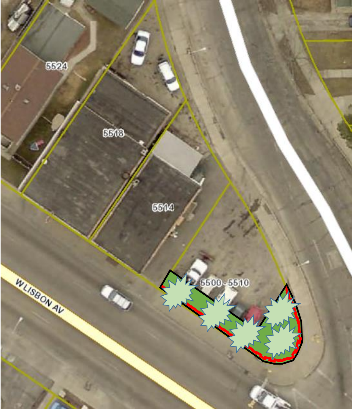
Landscaped buffer at Lisbon Avenue and the corner, with trees and shrubs. Ornamental fencing, with brick piers.