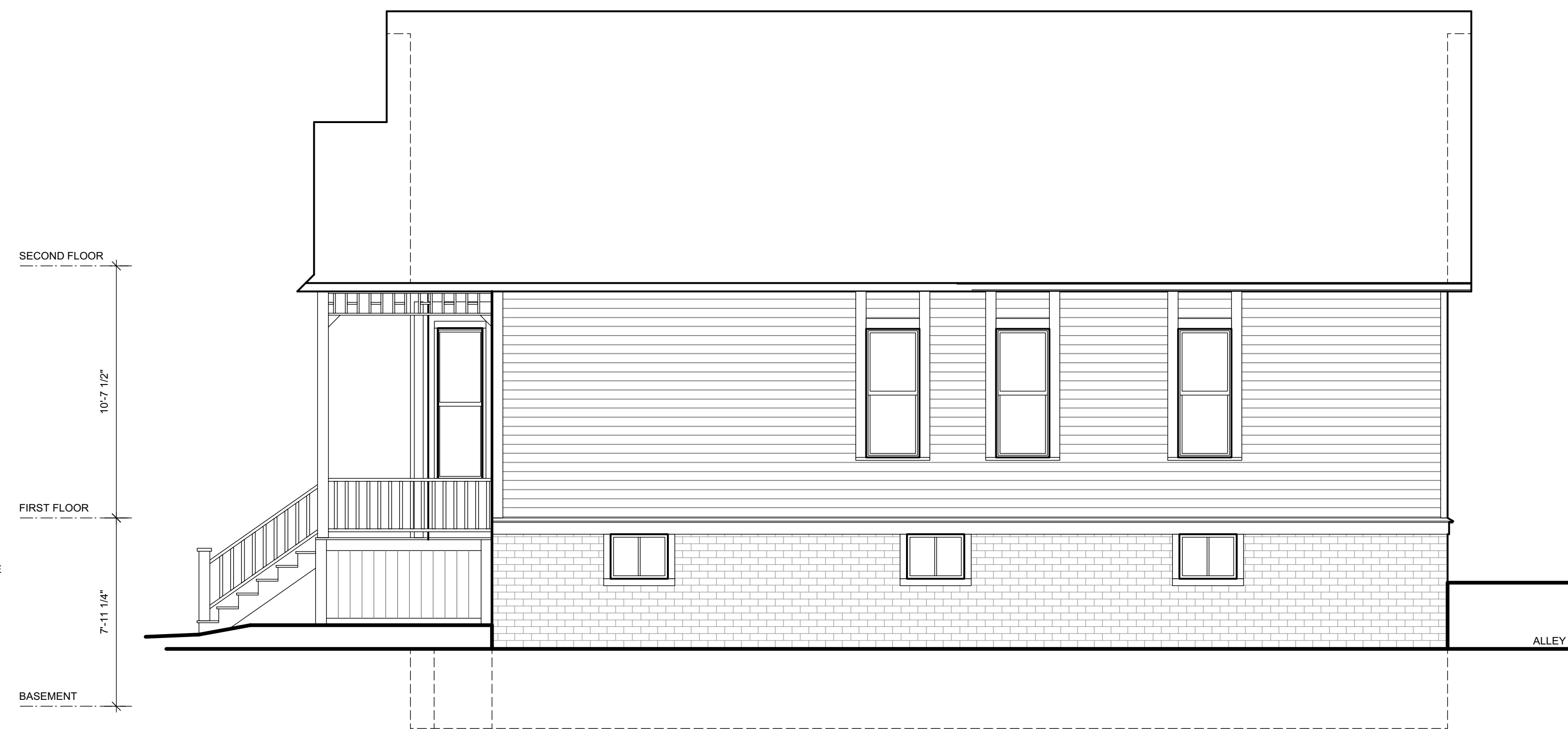
4 EXISTING SIDE (WEST) ELEVATION- (ALLEY VIEW) SCALE: 1/4" = 1'-0"