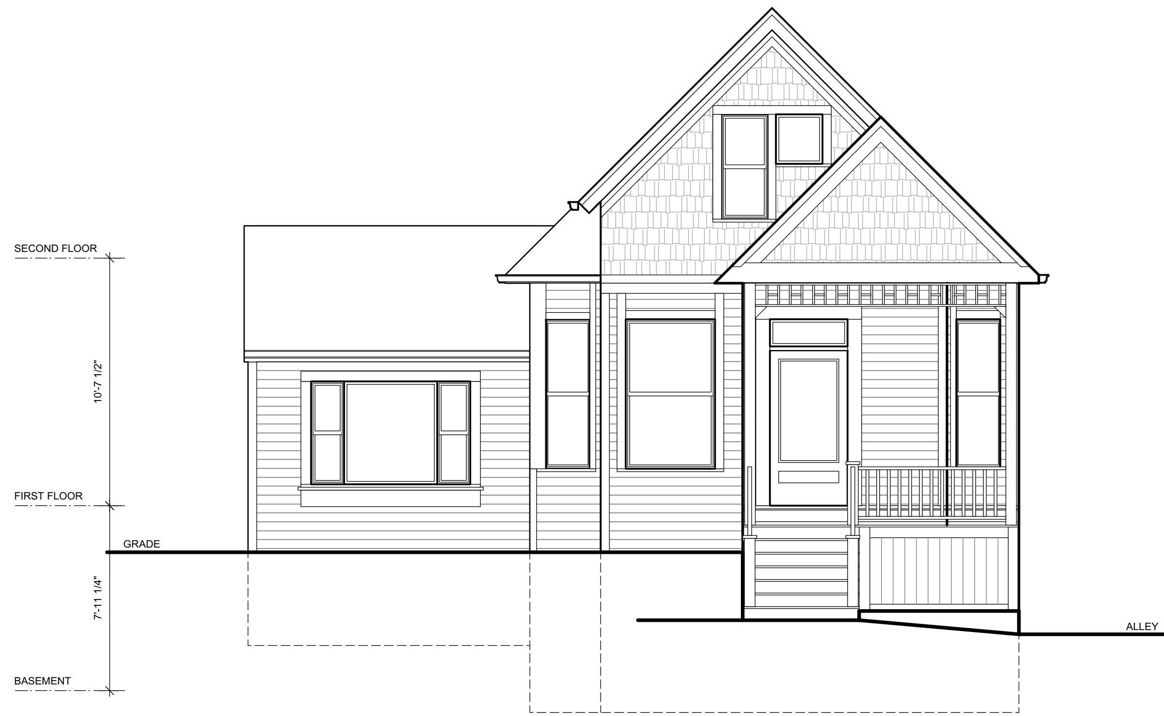
1 EXISTING FRONT (NORTH) ELEVATION SCALE: 1/4" = 1'-0"