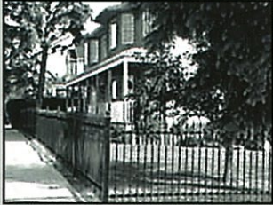
The fencing defines the site, thereby controlling access to the property. It also allows for strong natural surveillance.