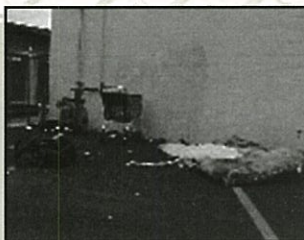
Little or no maintenance is taking place on this property, creating an image or sense that a person can do anything here and get away with it.