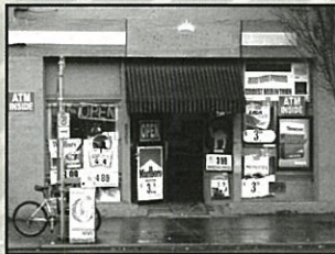
A would-be criminal may see this store as an easy one to rob because ads in the windows almost completely obscure the view inside.