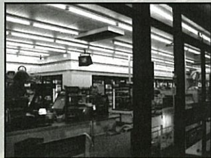
The managers of this convenience store maintain natural surveillance by keeping the windows clear of posters and ads.