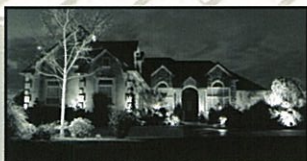
A good example of Territorial Reinforcement through the use of lighting.