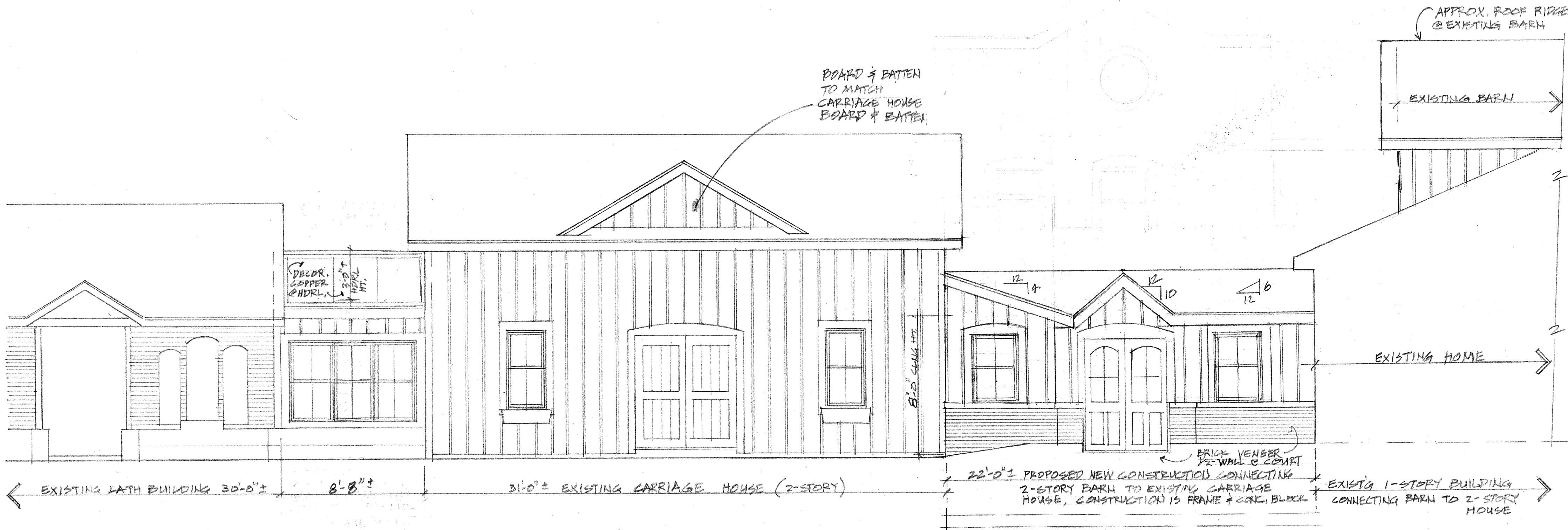
EAST VIEW FRONT ELEVATION 1/4"=1'-0"